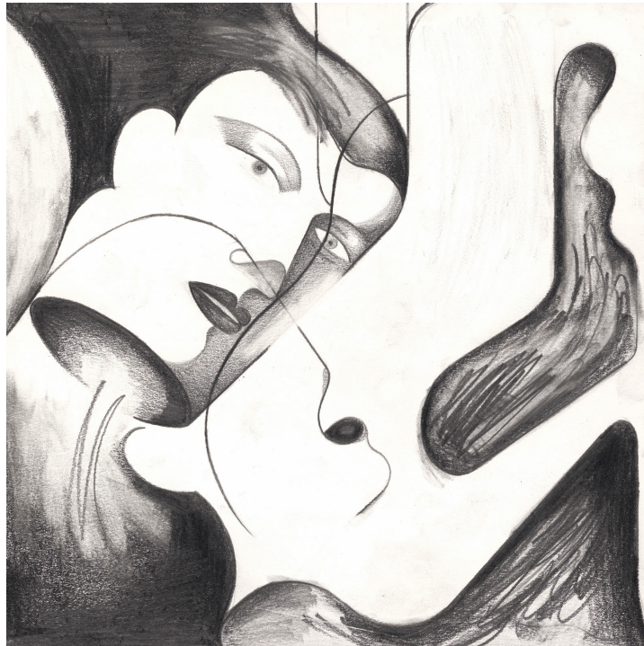
Fanny Michaëlis - Sans titre , Black pencil on paper, 20 x 20 cm, Signed and dated on the back