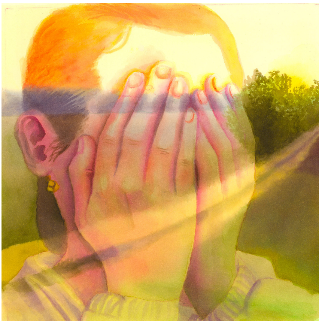
Maité Grandjouan - Tout doit disparaître , Watercolor on paper, 20 x 20 cm

Huberty & Breyne's Paris | Chapon gallery is delighted to be hosting this exhibition of over a hundred new drawings, due to run from 23 November 2024 to 4 January 2025 as part of its Mycélium programme.