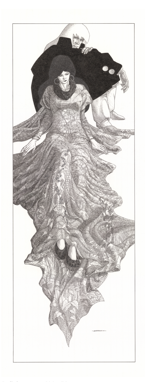
Deliah nature - 100 x 36 cm, Indian ink on paper.