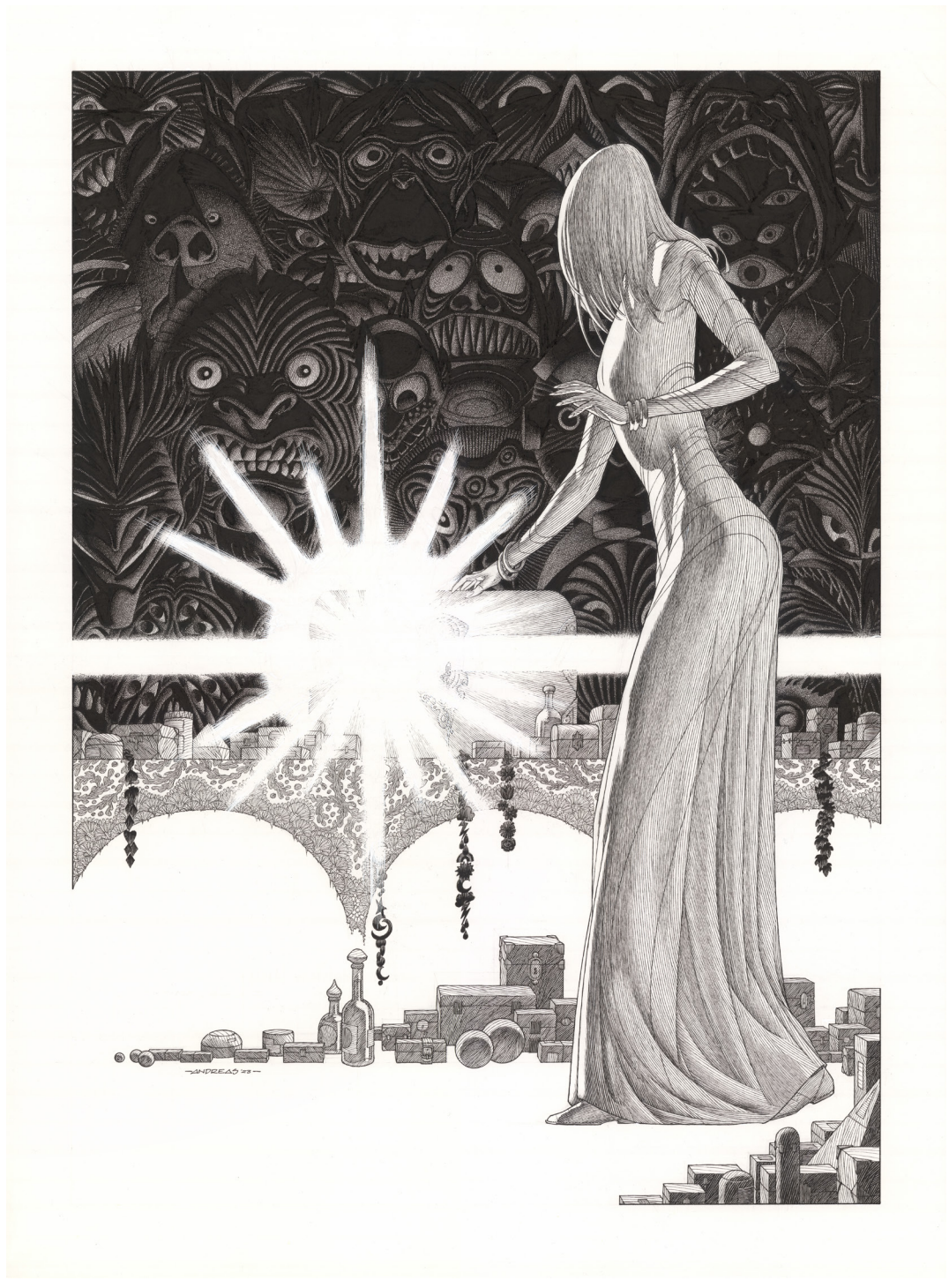
Pandore - 70 x 50 cm, Indian ink on paper.