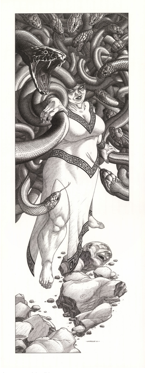
Gorgone - 90 x 30 cm, Indian ink on paper.