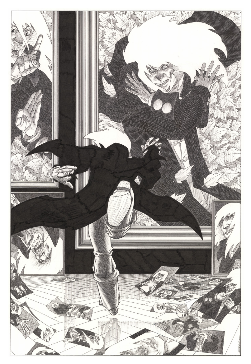
La course de Rork 1 - 60 x 40 cm, Indian ink on paper.