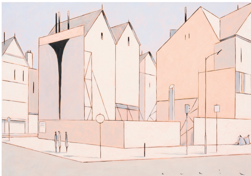
François AVRIL - Kunstruktion V - 2025 - Acrylic on canvas - 81 x 116 cm - Signed bottom right and dated on the back

Through the subtle play of light and colour, the urban landscape becomes a graphic reverie, its limits transcended. This chromatic harmony confers a special atmosphere on Avril's compositions, the artist favouring a light, luminous palette in which pastel shades create a warm, soft ambiance. Human beings are frequently absent, or simply hinted at as mere silhouettes – a conscious choice on the part of the artist, reinforcing the impression of silence and giving his paintings a distinctively meditative quality.