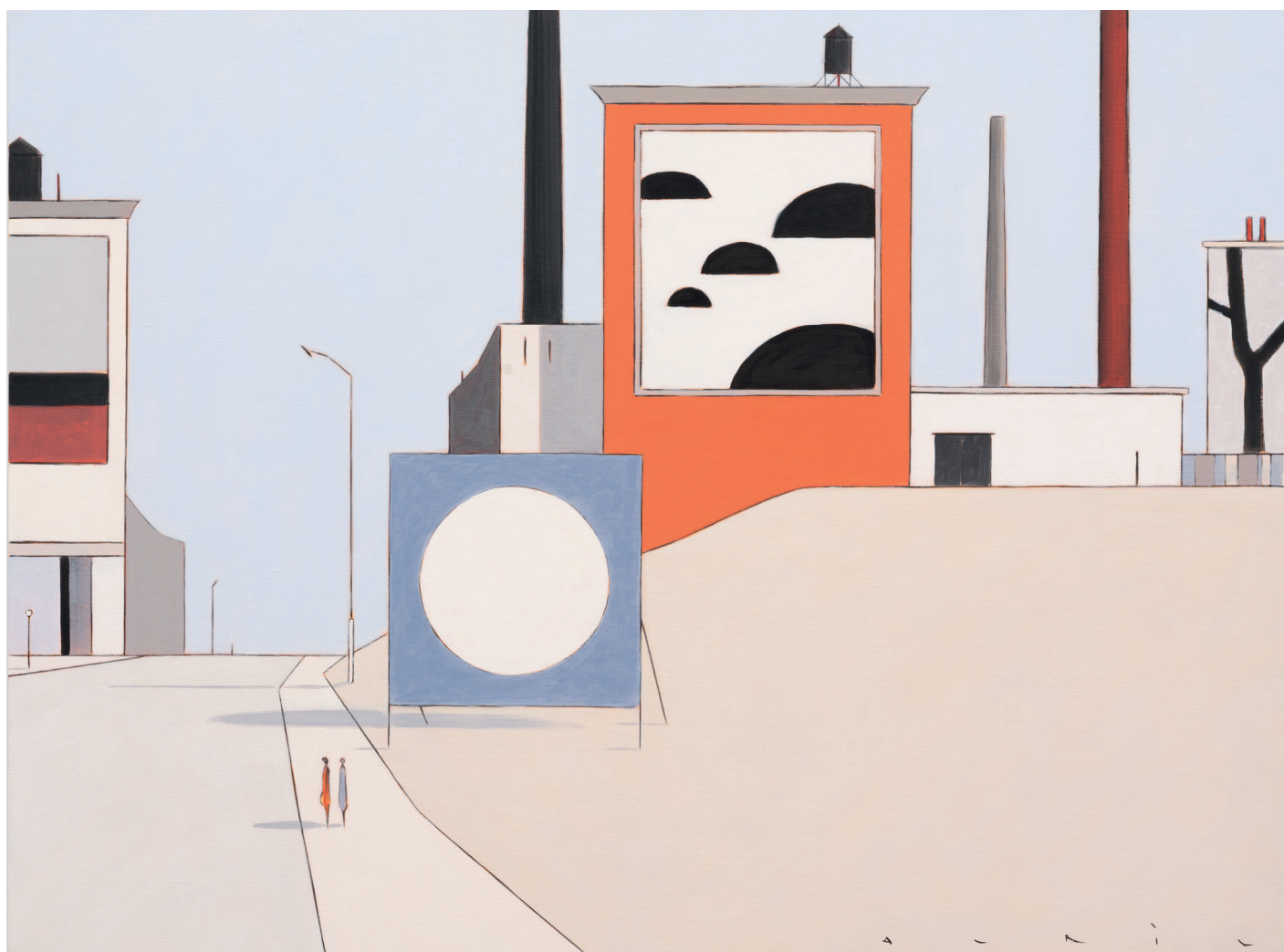
François AVRIL - Kunstruktion XIII - 2025 - Acrylic on canvas - 97 x 130 cm - Signed bottom right and dated on the back