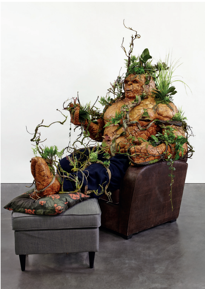
A very Old Thing — 180 x 180 x 115 cm