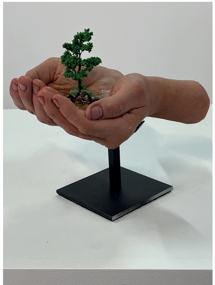
Offrir Une ÎLE