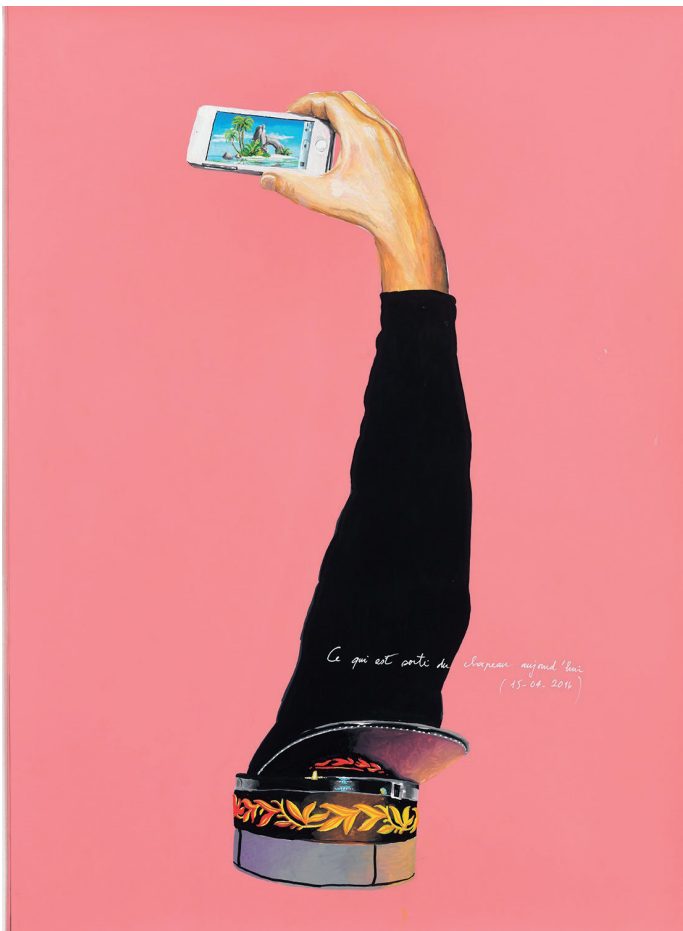
Ce qui est sorti du chapeau