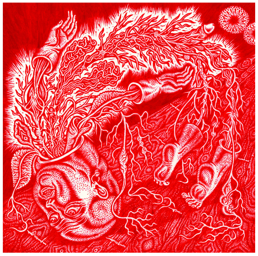
Rouge - 20 x 20 cm, encre d'enluminure, piment et miel

The exhibition, entitled Écume mercure au plexus, encompasses a selection of works in a variety of media – drawings, paintings and tapestries. It includes a new series of 100 drawings executed in blue ink, "Plexus Mercure", an explosion of fluid forms, where the masculine and the feminine proliferate and merge, powerfully and subtly, metamorphosing and fusing in climaxes of desire. Autobiographically inspired large-format paintings (210 x 300 cm), in monochrome red and teeming with detail, will also be on show, alongside magical tapestries woven in silk and wool. The result is an experience that wholly immerses us in the artist's visual universe.