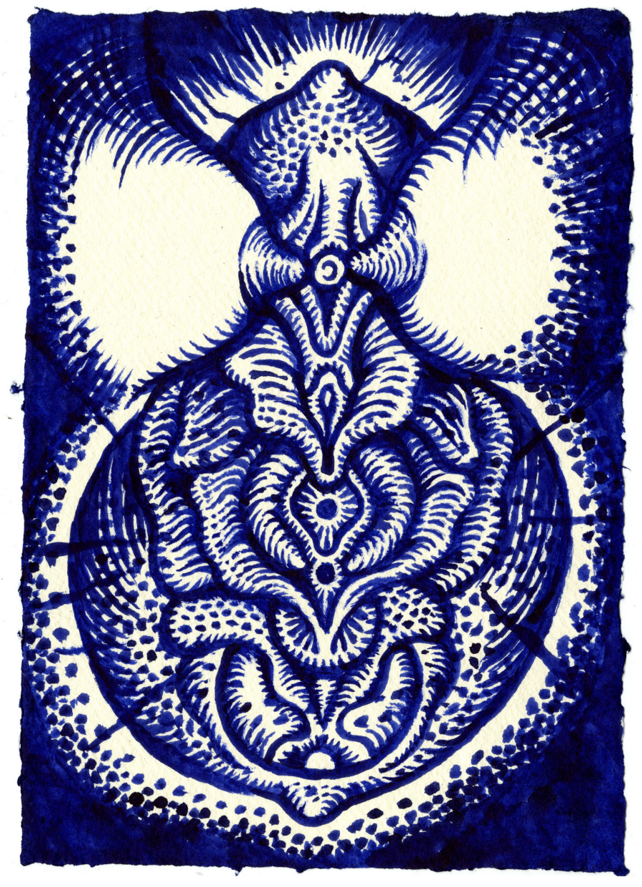
Plexus Mercure - 15 x 21 cm, encre d'enluminure, piment et miel

From 18 October to 23 November 2024, Huberty & Breyne will be hosting the first Brussels exhibition of work by the multimedia French artist Stéphane Blanquet. Blanquet immerses us in a strange and unfamiliar universe, where elements of the human body are placed within disquieting landscapes to form what appears to be a single organism. His is an art of metamorphosis, which challenges the viewer in ways that are both hard-hitting and subtle. A key exponent of a type of art that lies midway between figurativism and art brut, Blanquet regularly shows his work in institutional settings and alternative venues, in both Europe and Asia.