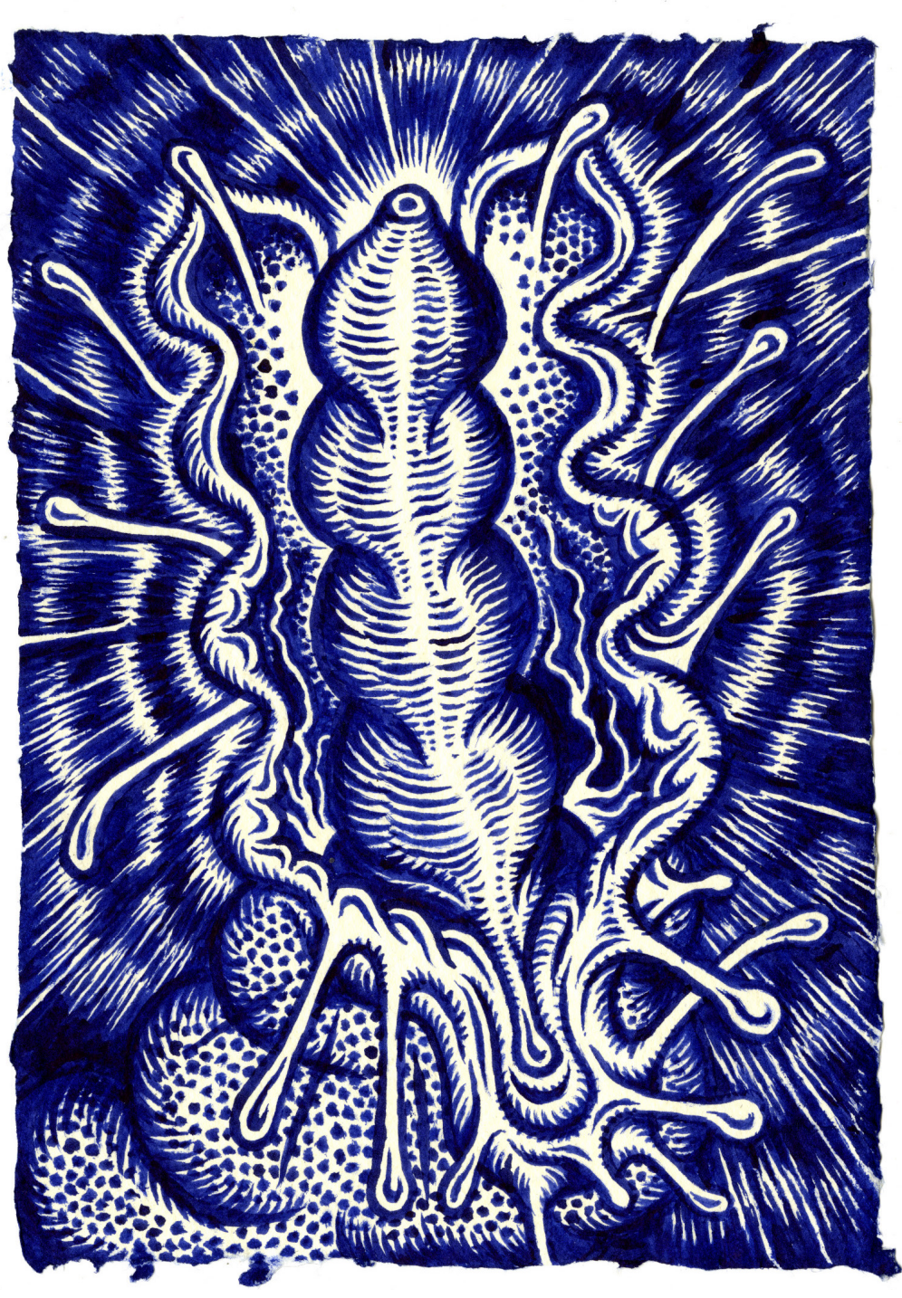
Plexus Mercure - 15 x 21 cm, encre d'enluminure, piment et miel