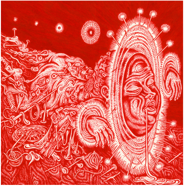
Rouge - 20 x 20 cm, encre d'enluminure, piment et miel

Exchanges with other artists and creators are crucially important to Blanquet's work, as reflected by his collaborations, publications (he has published works by more than 500 artists from across the globe), and organisation of exhibitions and events.