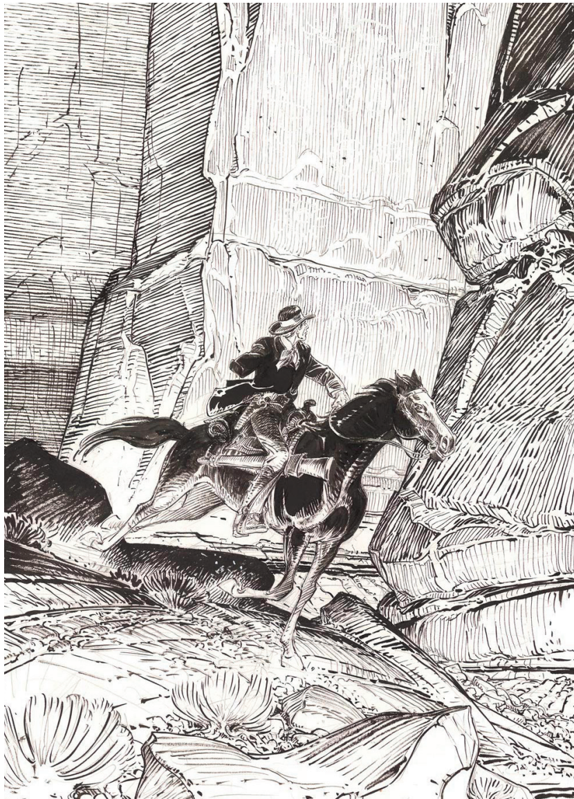
Bouncer - Draw (detail) - 94 x 35 cm

Though restricted to two dimensions, each of Boucq's images succeeds in bringing his subject matter strikingly to life. The format of his images gives the artist scope to express himself in free, sweeping gestures – a gestural approach manifested in the density of the ink he uses and the way that density diminishes as the brush travels across the paper. The energy of these pieces is irresistible: the viewer feels it intently and is drawn right into the scene, losing him- or herself in the contemplation of the image. François Boucq is a masterful exponent of the ninth art and these drawings are the clearest evidence of that, if any were needed.