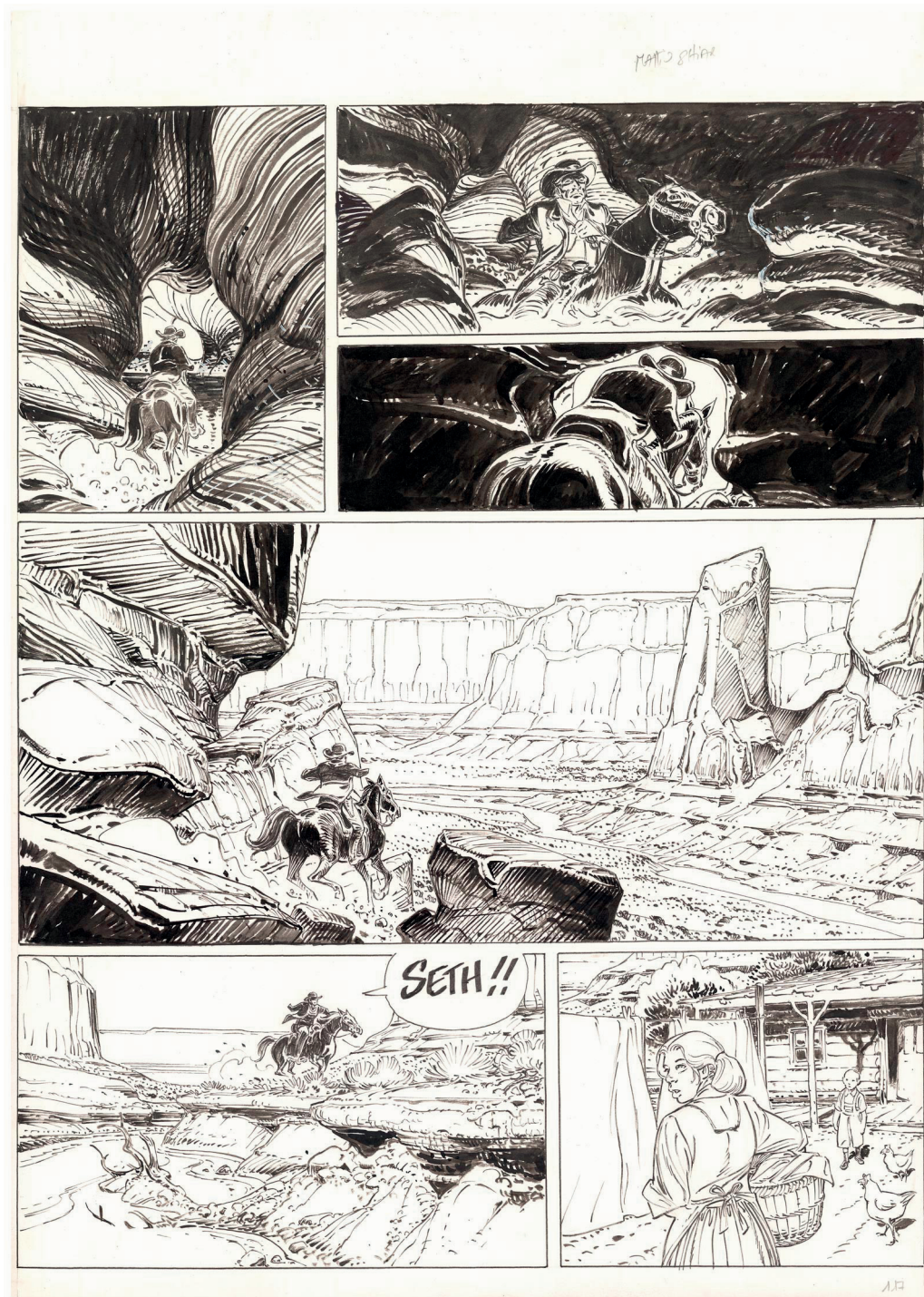
Bouncer - Hécatombe - Volume 12 - Plate 117 - 52,8 x 41,2 cm

Huberty & Breyne is delighted to be hosting an exhibition dedicated to Hécatombe (Éditions Glénat), the new album in the Bouncer series, drawn by François Boucq. As well as a selection of original plates from the album, the exhibition – due to run from 9 February to 9 March 2024 – includes an exceptional series of large-format drawings created by the artist specially for this event.