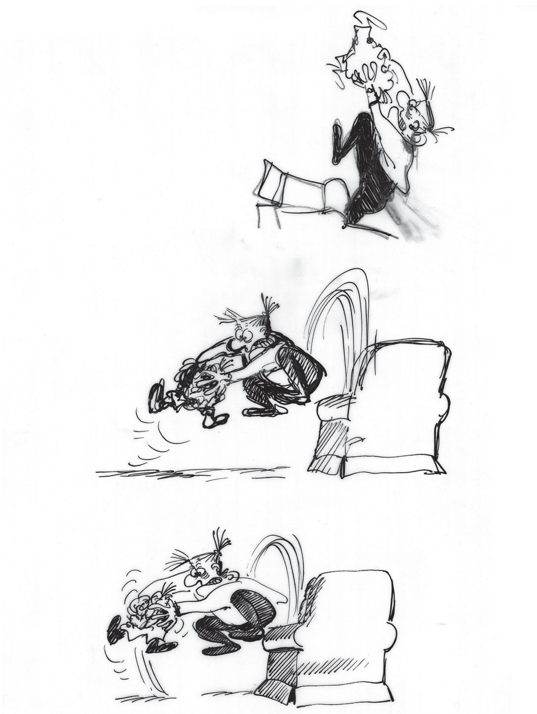
Le destin de Monique - Felt pen on tracing paper - 32 x 24,9 cm

The Huberty & Breyne | Chapon - 21 gallery is delighted to be showing "Études", an exhibition of preparatory drawings on tracing paper accompanied by the publication of a limited edition catalogue. Figure studies and compositions of plates for Agrippine , Les Mères , Le Destin de Monique and Docteur Ventouse Bobologue take us to the very heart of Claire Bretécher's creative process. The exhibition runs from 11 October to 15 November 2025.