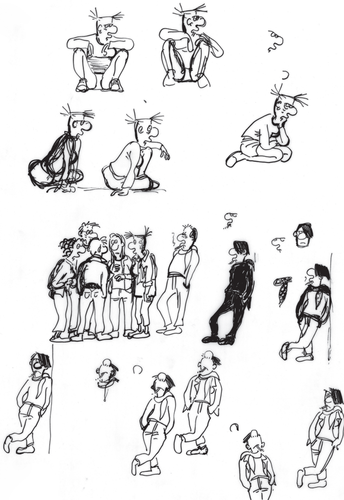
Le destin de Monique - Page 1 - Felt pen on tracing paper - 32 x 23,9 cm