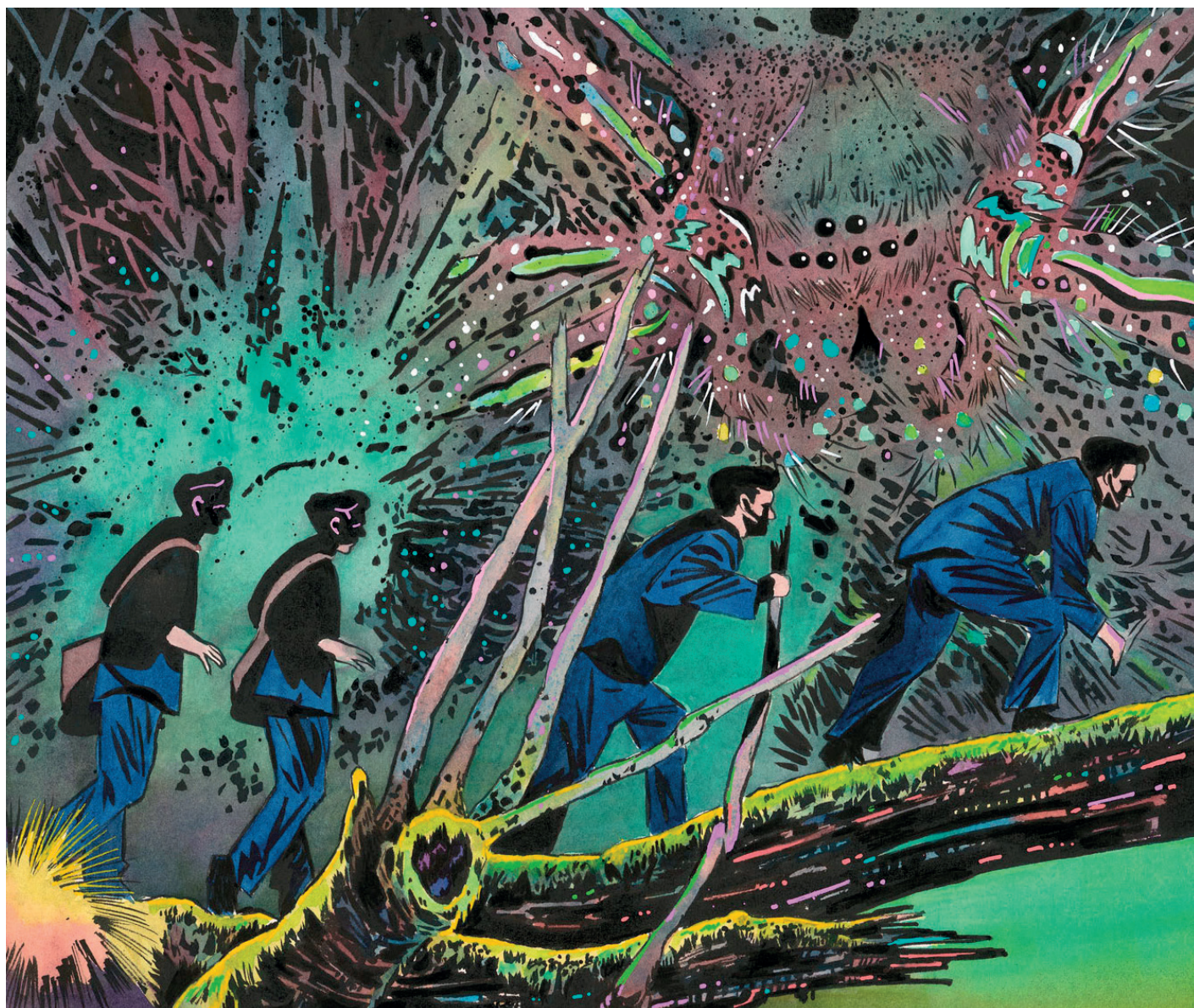
Grégoire CARLE - Le lierre et l'araignée - 2024 - India ink and watercolor on paper - 35 x 25,5 cm