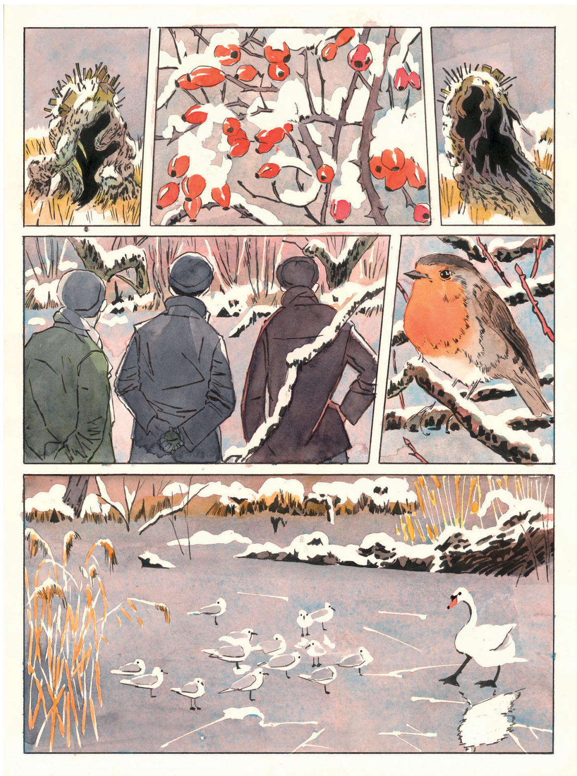
Grégoire CARLE - Le lierre et l'araignée - 2024 - Plate 96 - India ink and watercolor on paper - 35 x 25,5 cm