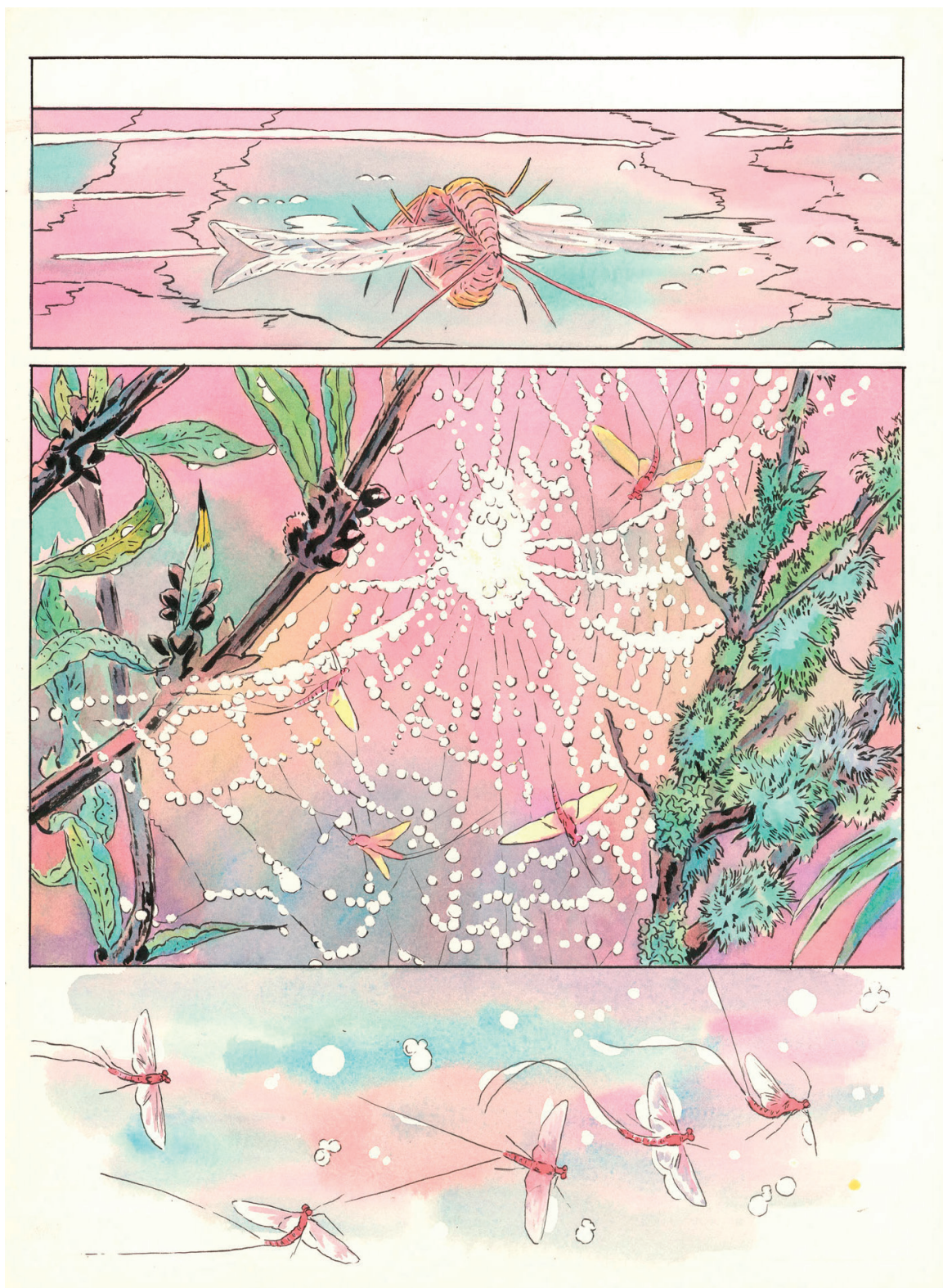
Grégoire CARLE - Le lierre et l'araignée - 2024 - Plate 43 - India ink and watercolor on paper - 35,3 x 25,5 cm