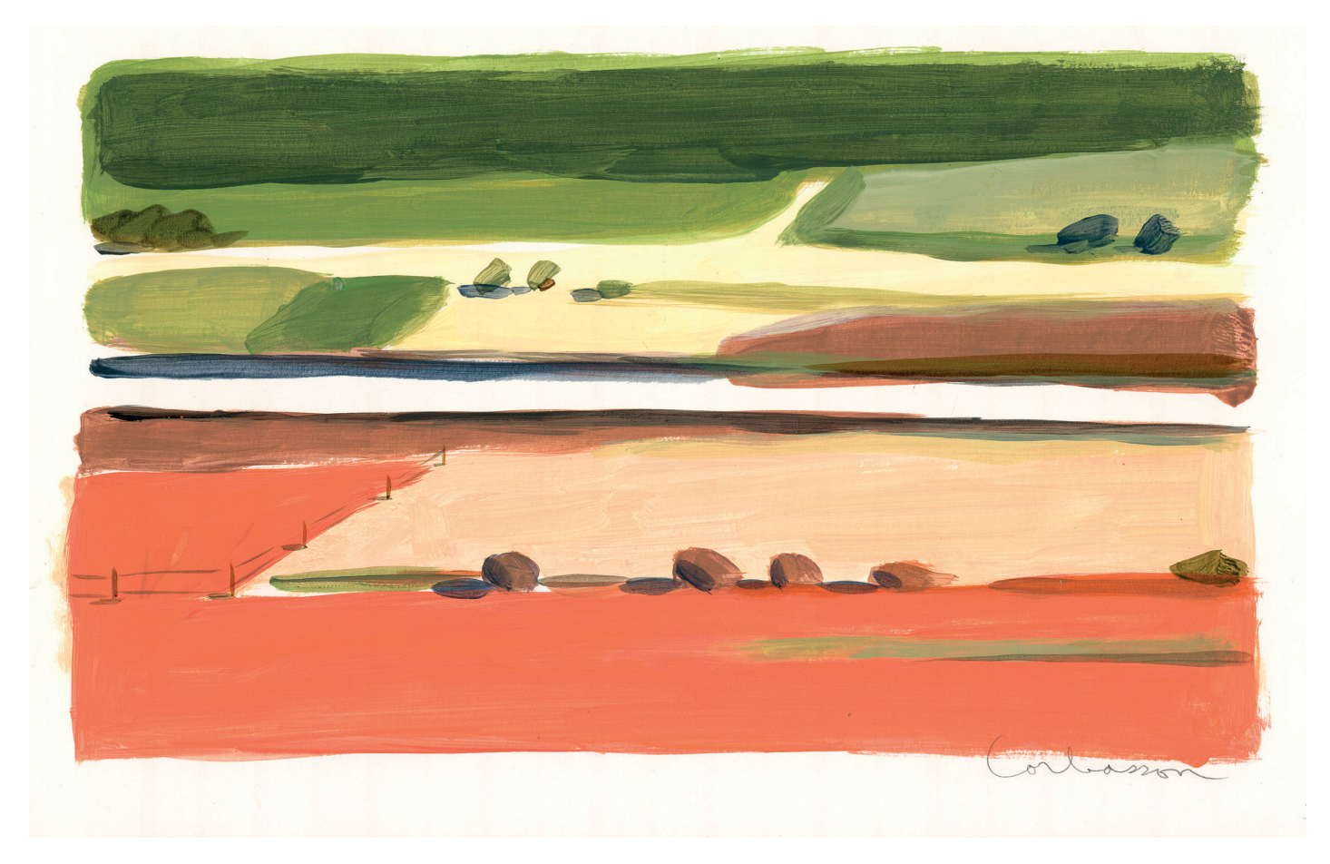
Fields - Dessin - 22,3 x 37,5 cm