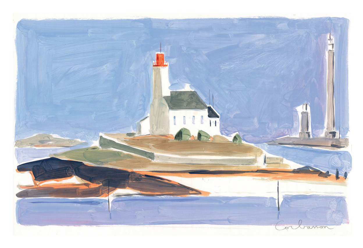
Finistère - Dessin - 39 x 61,5 cm