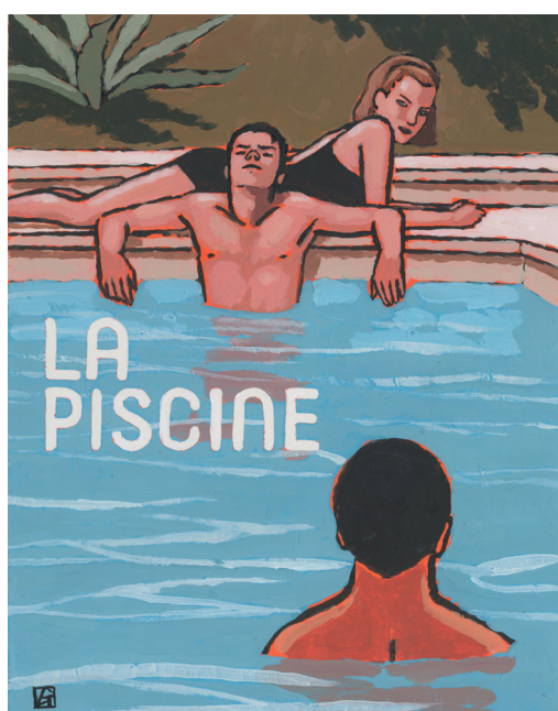
Jean-Claude Götting - La piscine 2, 2020 Acrylic on paper, 24.8 x 19.1 cm