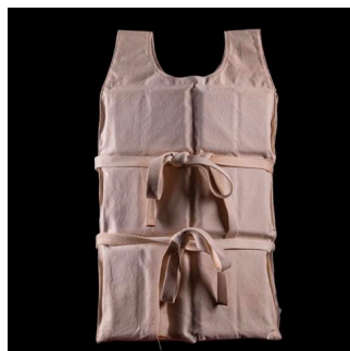
Original life jacket from the film Titanic (20th Century Fox, 1997) 70 x 44 x 4 cm

With the participation of Theatrum Mundi