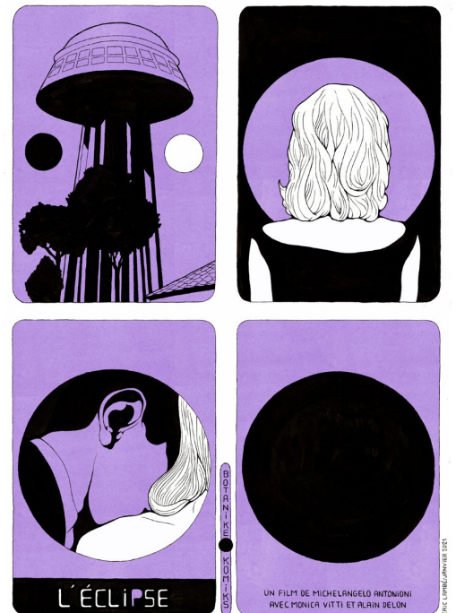
Eric Lambé - L'éclipse Digigraph, 59,4 x 42 cm