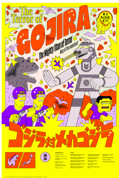
Filippo Fontana - Gorija Digital drawing, 90.2 x 60.5 cm