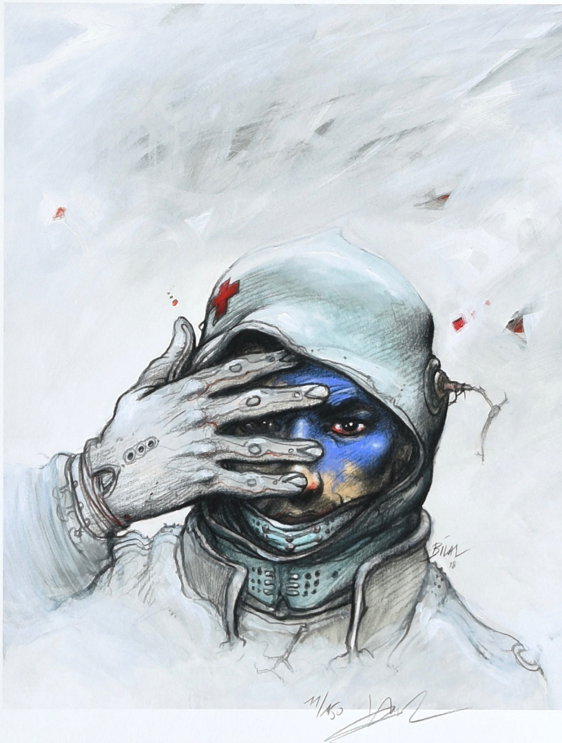
Enki BILAL - BUG II Pigment print, limited edition of 150 numbered and signed copies, 50 x 40 cm