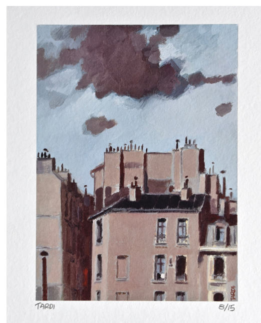
TARDI - Paris vu par... TARDI III Pigment print, limited edition of 15 numbered and signed copies, 60 x 43 cm