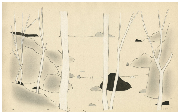
Sans titre 1 , 2020 Indian ink and colour crayons on paper, 27.2 x 42 cm