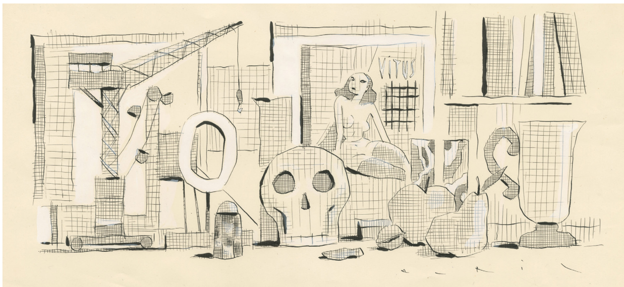
Bruxelles Atelier, 2020 Indian ink and white gouache on paper, 19 x 44 cm