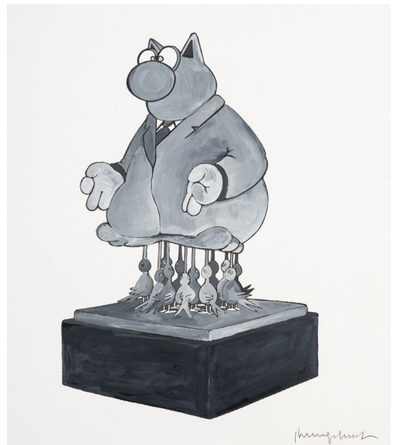
Rawhajpoutacha - Acrylic on cardboard, 50 x 60 cm