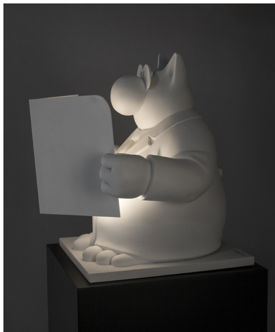
Chat lampe - Tout s'éclaire, painted resin and led light

The exhibition will also feature large-format paintings and drawings, as well as multiple works that pay homage to the great names in the history of art.