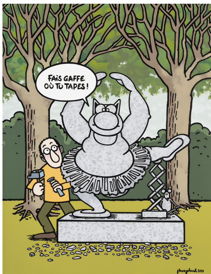
Fais gaffe où tu tapes - Acrylic on canvas, 146 x 114 cm

The inauguration of the exhibition in the Huberty & Breyne Gallery and the installation on the Champs-Élysées - both delayed due to lockdown - will take place on Thursday 25 March and Friday 26 March, respectively, in the presence of the artist