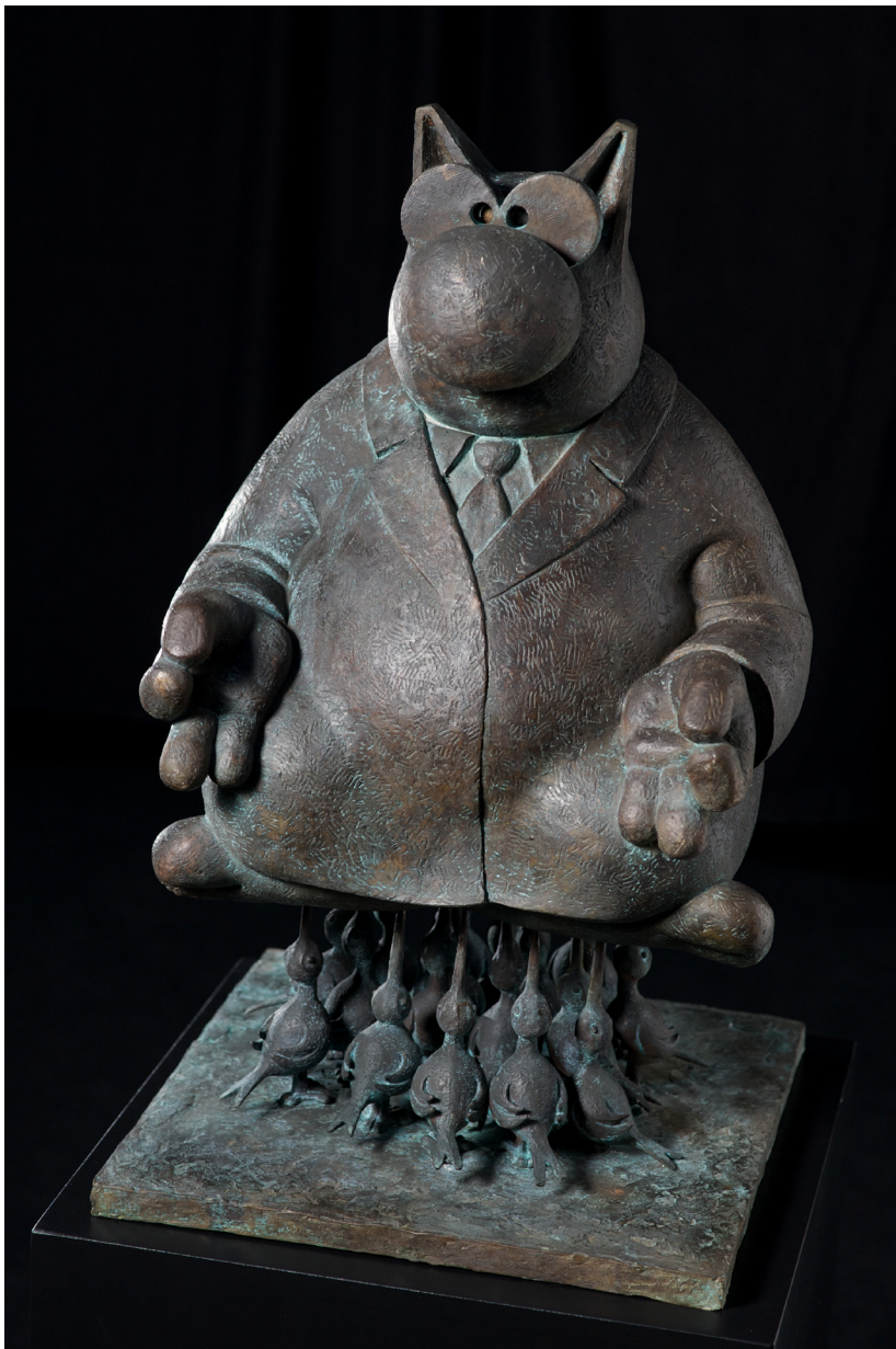
Rawhajpoutacha, lost wax bronze sculpture, 72 x 42 x 42 cm