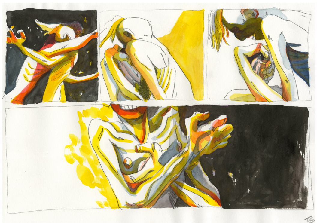
Nos corps alchimiques - Colour study, 1 Mixed technique on paper, 19 x 29 cm