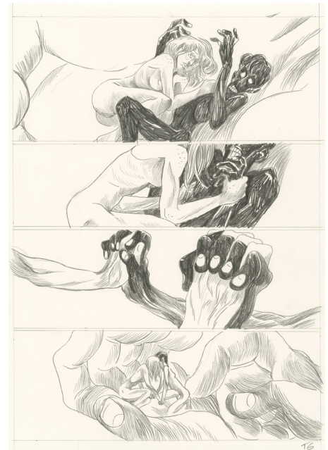
Nos corps alchimiques Plate 201 Graphite and charcoal on paper, 27.7 x 20 cm

In 2021, Gilbert published Nos corps alchimiques (Dargaud), a powerful story with a highly contemporary theme, in which three young lovers seek what amounts to a total revolution of their physical and mental being.