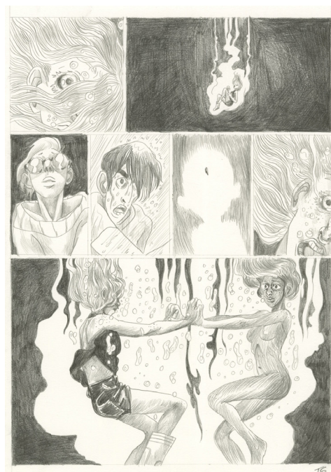
Nos corps alchimiques Plate 83 Graphite on paper, 28 x 20 cm