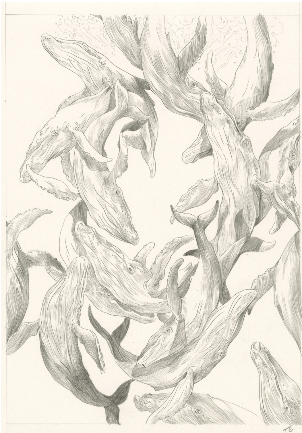
Nos corps alchimiques Plate 131 Graphite on paper, 27.7 x 20 cm