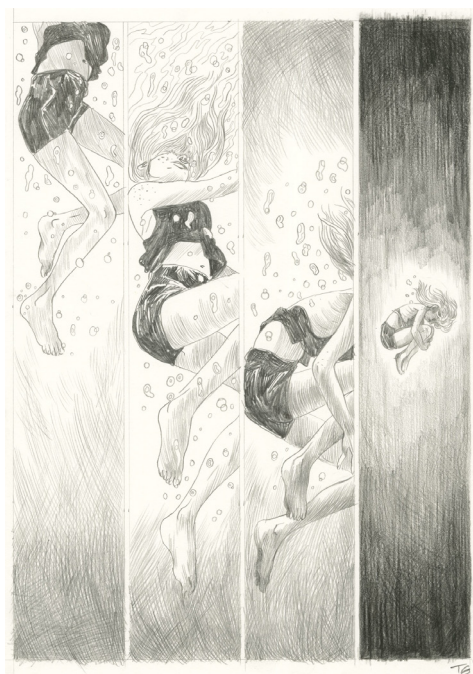
Nos corps alchimiques Plate 79 Graphite and charcoal on paper, 27.8 x 20 cm

From 2 to 31 July 2021, an exclusive collection of 41 original black and white plates, 7 colour studies and 6 pencil drawings will be on display, alongside the two storyboard notebooks for Nos corps alchimiques , which also form part of the exhibition.