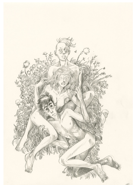
Nos corps alchimiques Plate 236 Graphite on paper, 22.5 x 17.2 cm