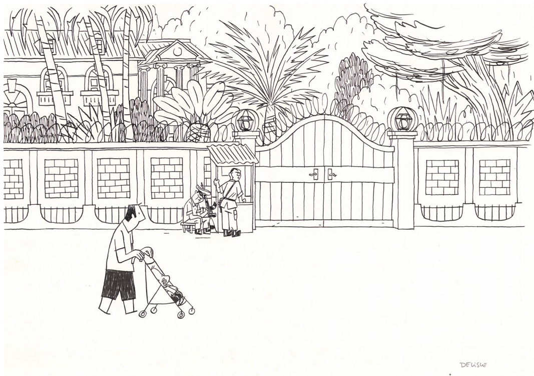
Guy DELISLE - Chroniques birmanes - Couverture de l'album - 2007 - Indian ink on paper - 25 x 41,8 cm Signed bottom right

After embracing a life of exile for the purposes of his work, Delisle accompanied his wife (a Médecins Sans Frontières administrator) to other parts of the world, where he took care of their children and produced Chroniques birmanes and Chroniques de Jérusalem , in which he once again assumed the role of observer of extraordinary geopolitical situations. Alongside these works, he also published works of fiction ( L'Inspecteur Moroni ) and humour ( Le Guide du mauvais père ) and a children's book ( Louis ). In Senfuir , he adapted the true story of an NGO administrator who was taken hostage in the Caucasus region and succeeded in escaping captivity; he provided the drawings for an album written by Lewis Trondheim and Joann Sfar in the Dungeons & Dragons series, and he has just produced the biography of Eadweard Muybridge, a pioneer in the field of the photography of motion ... and a murderer ( Pour une fraction de seconde ).