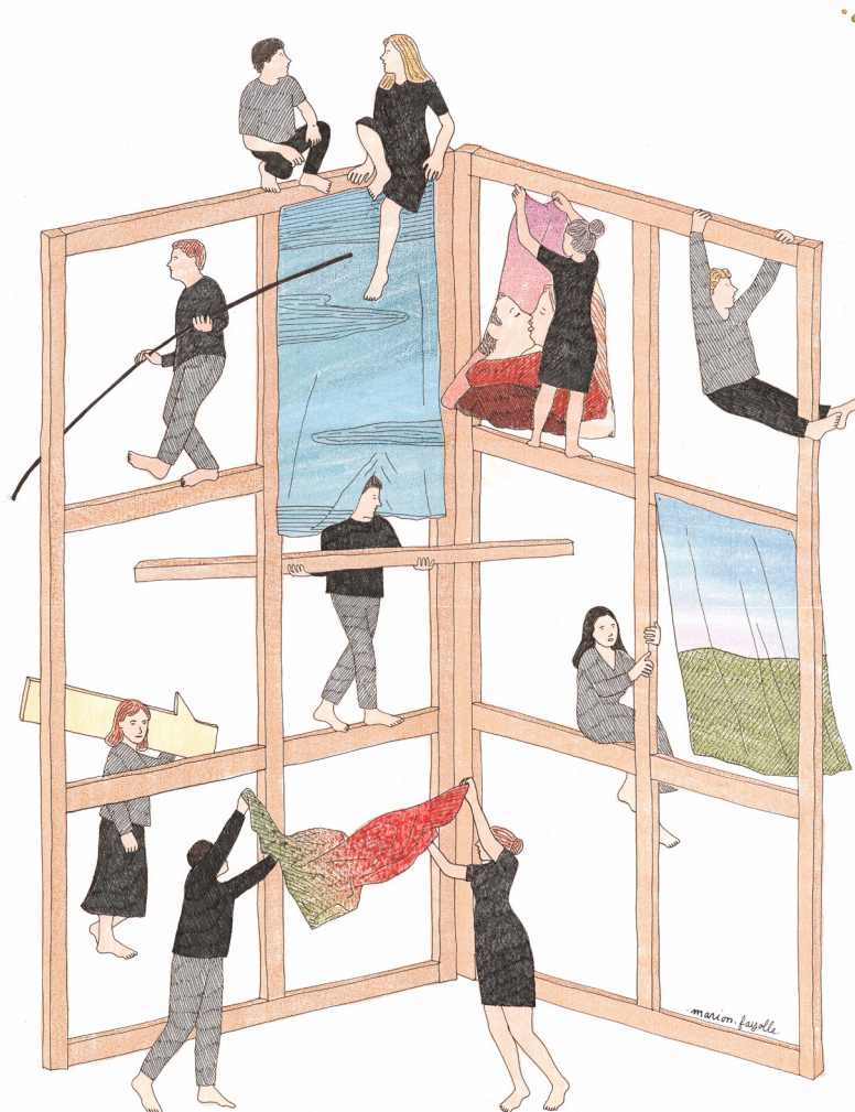
Marion FAYOLLE - Constuire - 2024 - Ink transfer and India ink on paper 32,5 x 26 cm - Signé en bas à droite

Marion Fayolle is an illustrator, novelist and poet focused on images, which, in Fayolle's view, precede meaning. Her drawings are like windows on to the imagination, offering a slant, poetic and humorous perspective on the world. As in a dream, the images speak for themselves. Fayolle plays with meaning and mystery, shifting reality into a choreography of bodies against a white ground. Her colour transfer work offers the viewer "flawed" textures, transparent vibrations that, like her characters, resemble ghostly projections on to the paper. Clear, fluid and minimalist, Marion Fayolle's drawings question identity and our relationship to others in metaphorical scenes from which, despite her economy of means, complex emotions are capable of emerging.