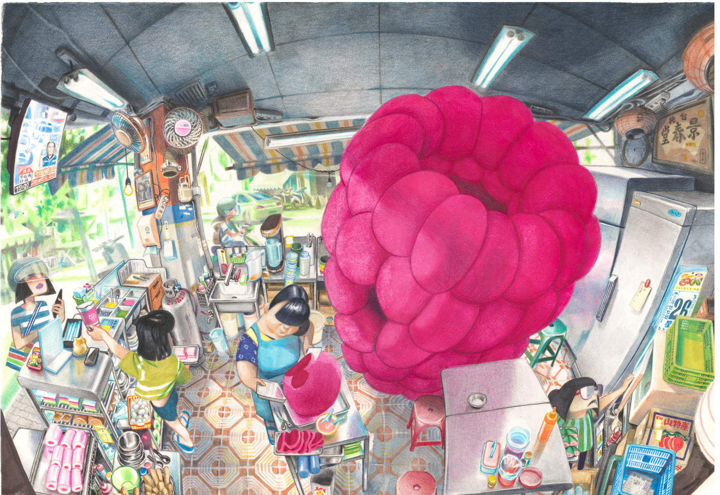
Florent CHAVOUET - Gros fruit n°2 - 2025 - Mixed technique on paper - 29,3 x 41,7 cm - Signed and dated bottom left