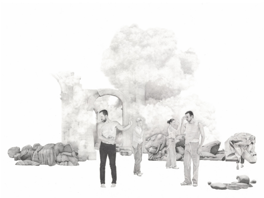
Anne TOUQUET - Derrière les paupières, un souffle - 2026 - Graphite on paper - 50 x 75,5 cm Signed and dated on the back

Anne Touquet's drawings are imbued with a fascination for ruins and the fragility of things. And we, like astonished archaeologists, are invited to observe these enigmatic remnants of the past that hover midway between reality and dream – faces of statues, weather-worn and patched with lichen; decorative fragments, centuries old; petrified flesh engaged in strange rituals, frozen in time.