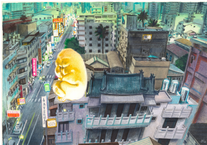
Florent CHAVOUET - Coucou n°7 - 2026 - Mixed technique on paper - 21 x 30,4 cm Signé en bas à droite

In the city's ceaseless flow, Florent Chavouet is out of step. He pauses where others pass on by, jots in his notebook words overheard, searches for the best vantage point from which to draw this concrete jungle. Colour pencils become his greatest ally – easy to transport and practical for on-the-spot sketches, made in sometimes perilous conditions. Florent Chavouet has mastered the technique, playing with velvety textures that contrast with sharply drawn lines, alternating transparency and opacity in chiaroscuro effects that only he knows how to achieve. Nuanced or contrasting, his colours capture the pulse of an urban scene as it unfolds before his eyes – the gait of a passer-by, a neon sign reflected in the glass of a vending machine ... On paper, he compiles a poetic inventory of everyday life. Every detail offers a pretext for a drawing: the chilly metal of a utility pole, the bark of a tree or the pleats of a piece of fabric. Florent Chavouet captures atmosphere and emotions, textures and light, which together weave a narrative composed of subtle connections between nature, architecture and the people who inhabit these spaces. His drawing is as much a map-making process as a piece of story telling. He sketches street façades, some of which no longer exist, attempting to re-locate them on meticulously drawn maps, as if to preserve their memory, the ghost of their existence. His images, like fragments of memory, sensitively restore the geography and history of place.