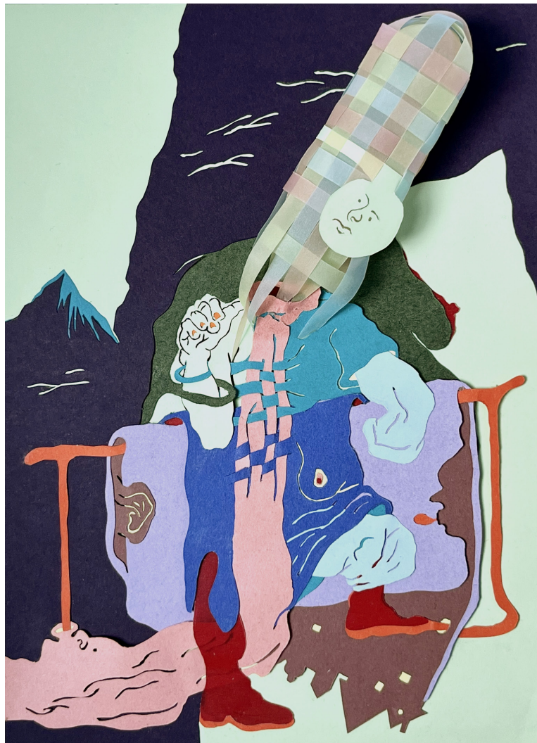
Cornelia EICHHORN - You wear me out , 1 - 2026 - Paper cutout - 18 x 13 cm Signed on the back

In Cornelia Eichhorn's work with paper cut-outs, colour pre-exists: it is the material from which she "sculpts". There is touch here, embrace, and contrast, but no actual mixing or dilution: the colour is fixed. Cornelia Eichhorn works with colour through association. Whether contrasting or monochrome shades, the colours do not blend but resonate, vibrating differently according to the arrangements, the interplay of layering and transparency. The artist's technique is painstaking. Using a scalpel, she cuts into the paper with surgical precision, working against the grain to extract a variety of sinuous forms. This process enables the artist to create as many shapes in the paper she cuts as she accumulates from it. She plays on the ideas of fullness and emptiness, revealing what was previously invisible by superimposing layers of dissected forms. It is a technique that allows her to create subtle reliefs that take shape as she assembles her pieces of paper. Like limbs or appendages with natural or accidental openings, the cut paper invites the viewer to look inside, and guess what is happening underneath.