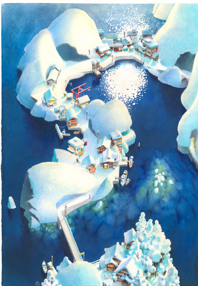
Florent CHAVOUET - Ile flottante - 2025 - Aquarelle sur papier - 21,3 x 15,1 cm Signé et daté en bas à gauche

Through this selection, the gallery fosters a dialogue among contemporary drawing practices, where formal exploration, technical experimentation, and distinctive styles intersect. This presentation reflects its commitment to supporting artists with distinctive artistic worlds, while highlighting the vitality and diversity of drawing today.