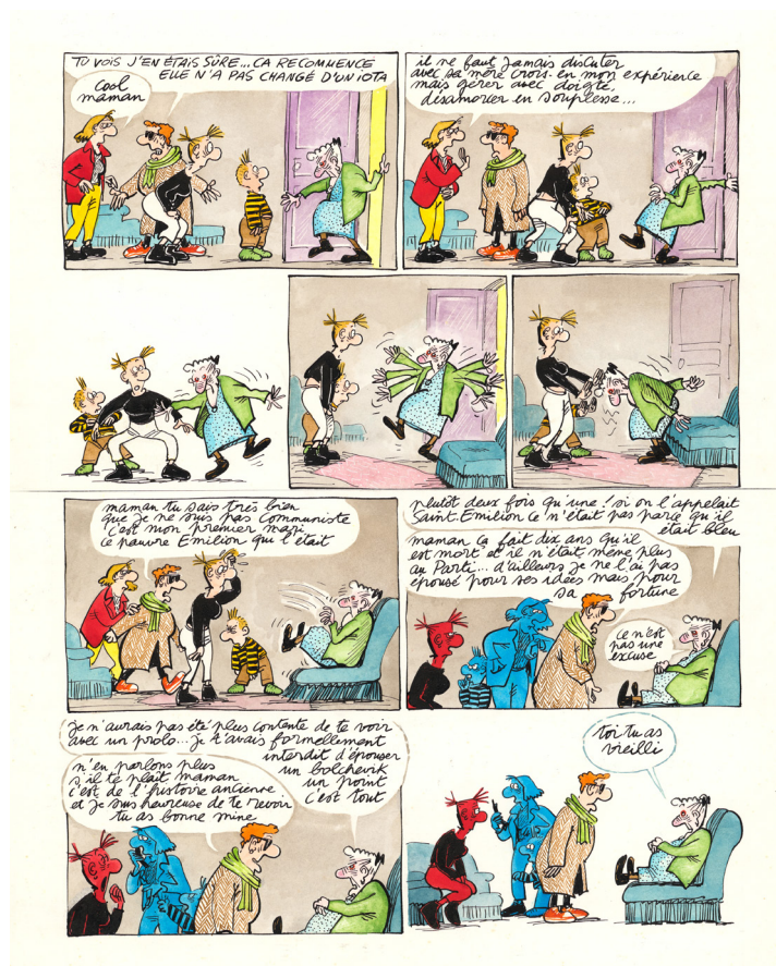
Claire BRETÉCHER - Agrippine et l'ancêtre - Agrippine - 1998 India ink and watercolor on paper - 30 x 23,4 cm

Agrippine et l'ancêtre , self-published in 1998, is the first of these. Not only is the story long, but it is drawn on paper and colored directly by Claire Bretécher herself. This technique is rare because it leaves no room for error. One mistake, and the whole thing has to be redone. In this scene, for once, she places her heroine in the background amidst the generational conflict embodied by her mother, grandmother, and great-grandmother. The mechanics of this matriarchy are spot-on and scathing, an extraordinary mise en abîme of her timeless and universal signature theme. Finally, this original page must be considered as a whole. By broadening our perspective, we see the perfect contrast between the situational comedy in the first two panels and the prominence given to dialogue in the second half of the page. With Bretécher, it is literally all about balance.