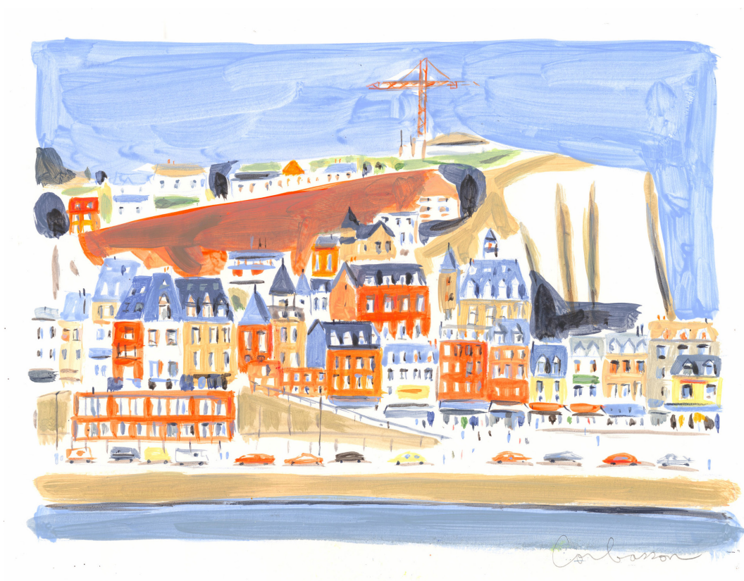
Dominique CORBASSON - Falaise I - Acrylic on paper - 22 x 30,5 cm - Signed bottom right

Her gaze was not confined to the urban environment, however. Dominique CORBASSON felt an affinity with the natural world, and with Brittany in particular, and both occupy an important place in her work. The Breton coastline, Californian shores, Scottish landscapes and the light of the Northern hemisphere all provided inspiration for works where the horizon, the sea and nature's greenery are the primary focus. Whatever her subject, Dominique CORBASSON captures above all the atmosphere of a place. In her drawings as in her paintings, architectural elements, trees and human figures coexist in perfect harmony, while a bold palette, luminous expanses of colour and a relaxed drawing style give her works a striking originality.