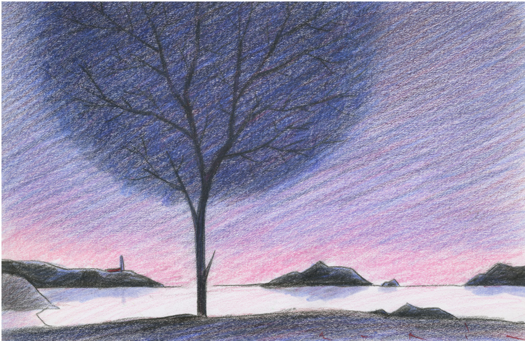
François AVRIL - Evening - 2025 - Colored pencils on paper - 18 x 27,7 cm - Signed bottom left

Whether he is focusing on an urban or a natural landscape, François AVRIL is less intent on mimicking reality than distilling the essence of what he sees, leaving the viewer total freedom of interpretation.