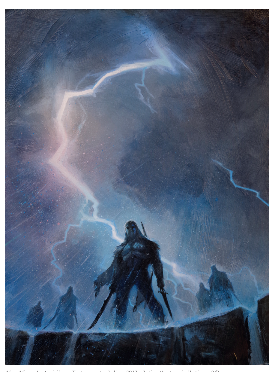
Alex Alice - Le troisième Testament - Julius, 2013 - Julius III - La révélation - 2/2