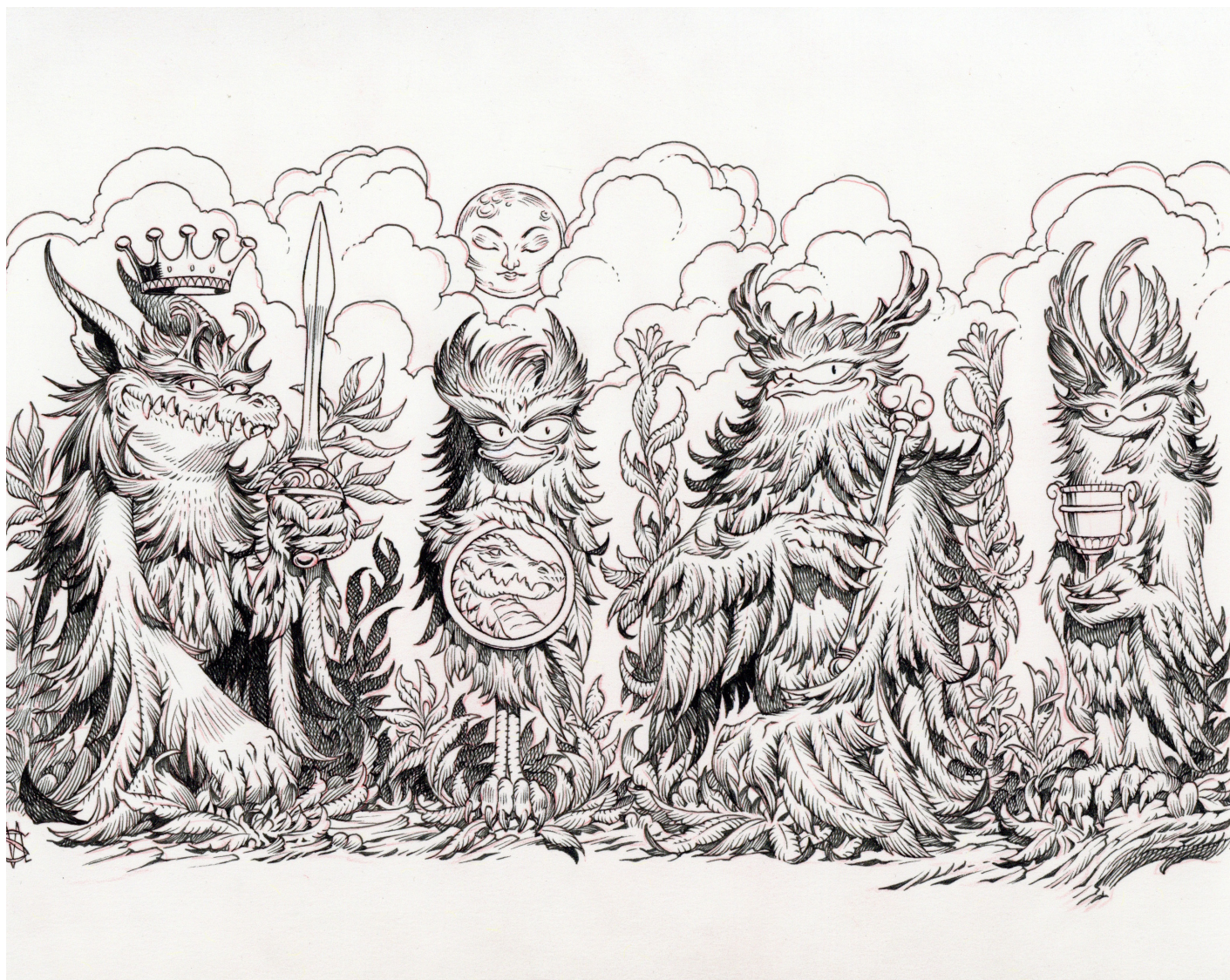
Stan Manoukian - Habillage boitier , India ink and red pencil on paper, 12 x 22 cm, Signed bottom left