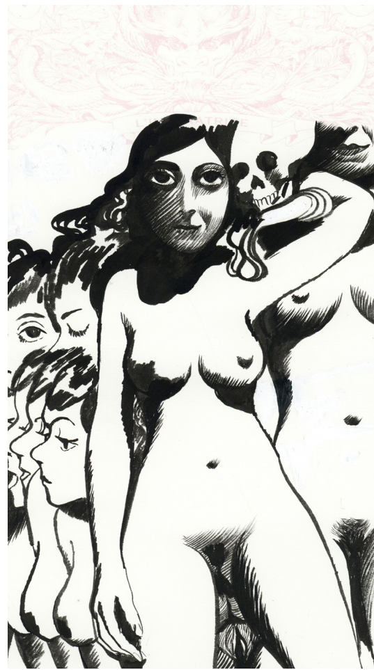
Manuele Fior - N°18 - La Lune , India ink on paper, 35,5 x 19 cm, Signed bottom right