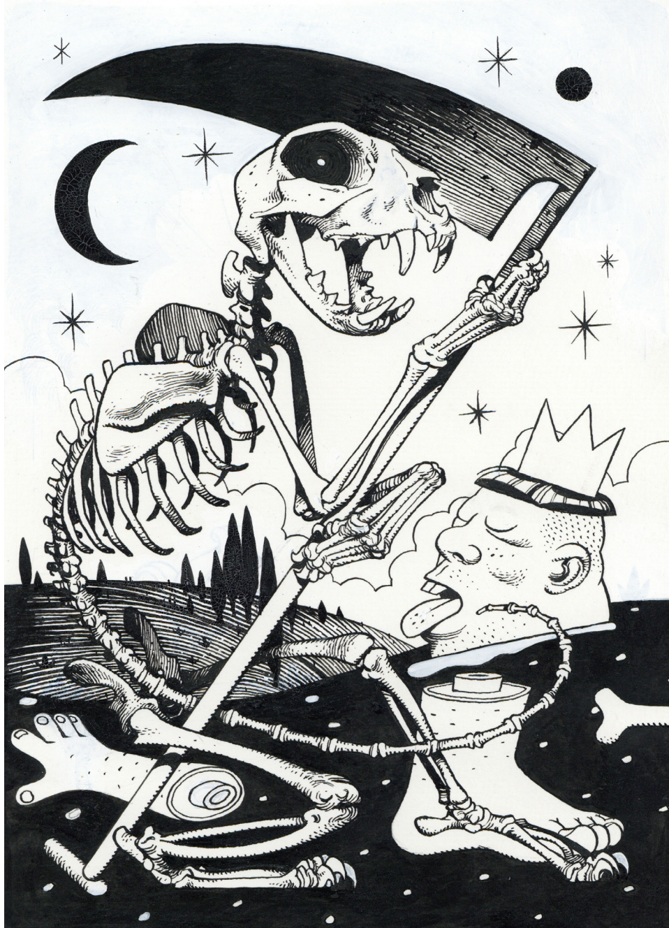
Julien Loïs - N°13 - La mort , India ink on paper, 28 x 20 cm, Signed and dated bottom right