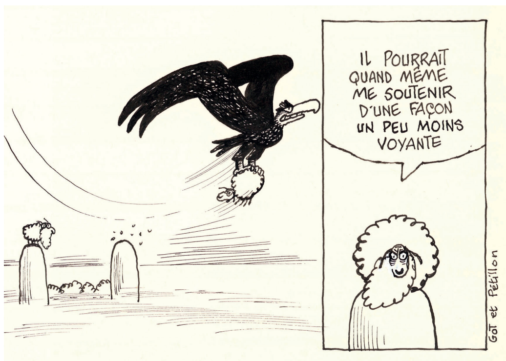
Le Baron Noir, Conversation en vol (détail) - 15,5 x 41,5 cm

This exhibition will be showing several plates from "Le Baron noir", as well as some of Got's press illustrations and other comic drawings.