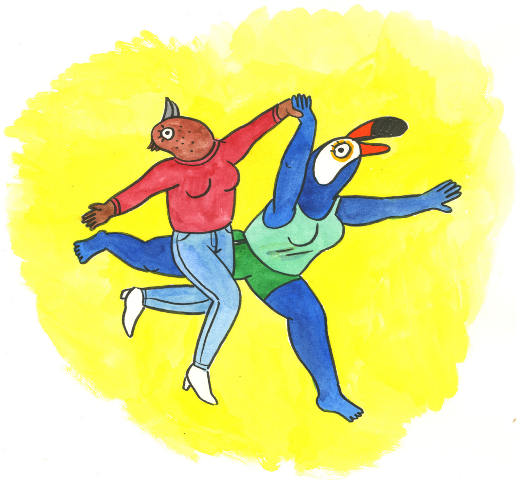
Tuca & Bertie promo 2 - Mixed technique on paper - 17,5 x 18,5 cm - Signed bottom right

This exhibition brings together a collection of preparatory sketches for Hanawalt's Tuca & Bertie series, short stories, drawings and illustrations taken from her "polygraphic" books My Dirty Dumb Eyes , Hot Dog Taste Test and I Want You , and original pages from Coyote Doggirl . The result is a kind of cabinet of curiosities of the absurd, in which we encounter the various styles, formats and techniques used by Lisa Hanawalt to disrupt artistic conventions, demolish artistic boundaries and explore, with complete freedom, drawing's labyrinthine potential.