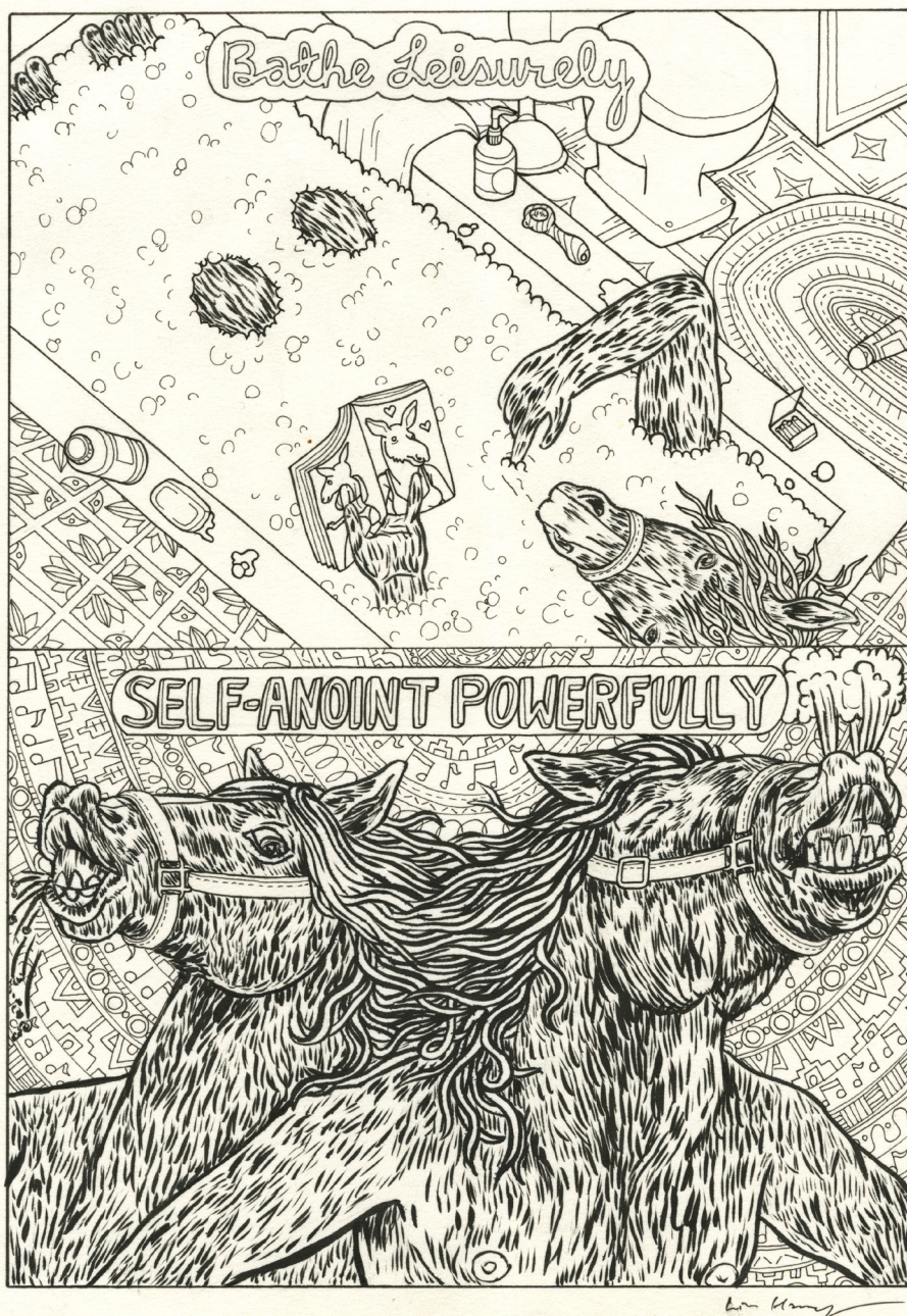
Saturday Night - page 5 - Indian ink on paper - 26,7 x 19 cm - Signed bottom right