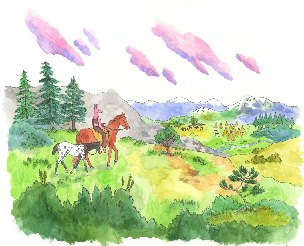
Coyote Doggirl - Returning with a Gift - Indian ink and watercolor on paper - 15 x 21,5 cm - Signed bottom right