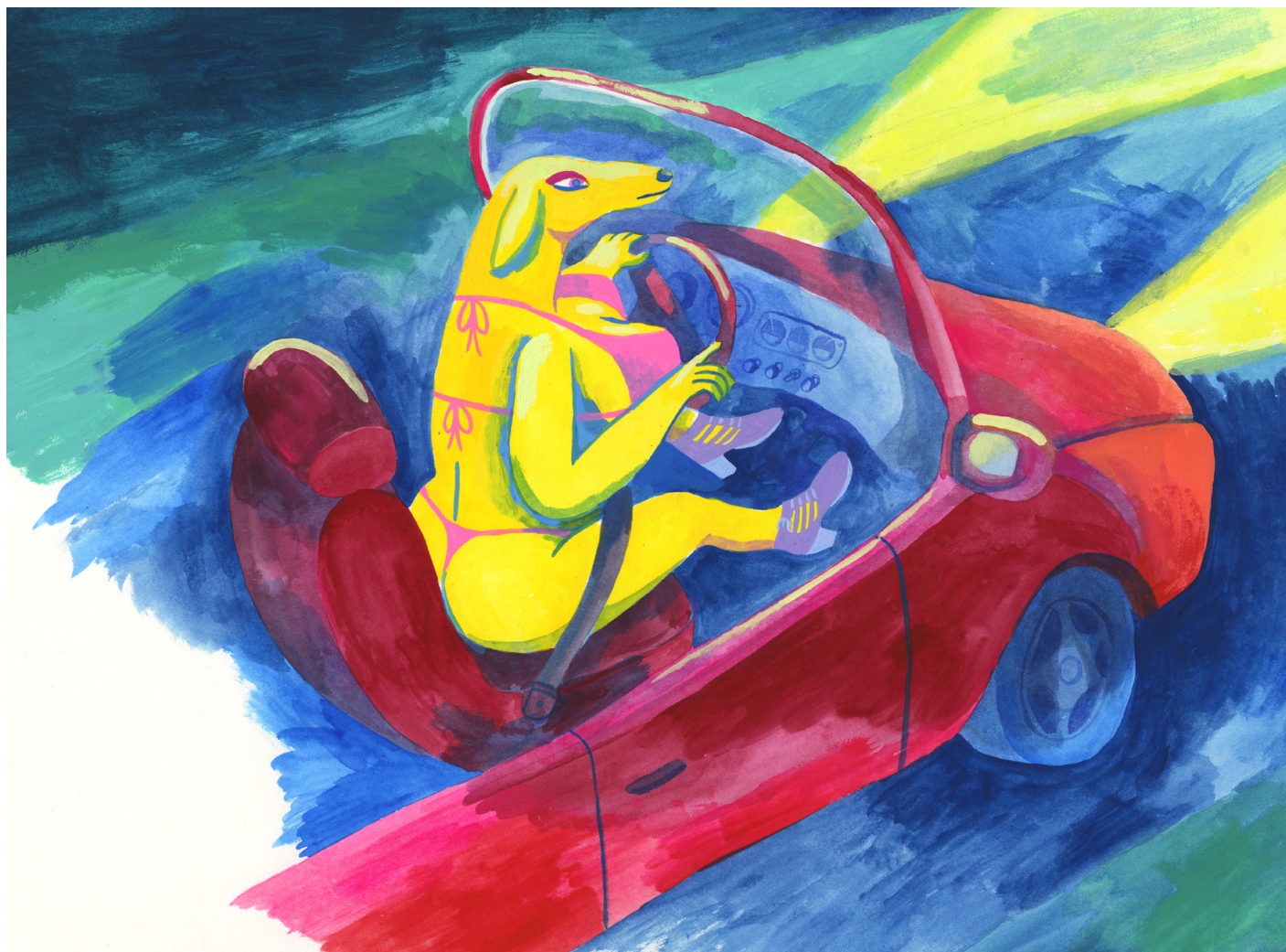
Big Boob Driving Dog - Gouache on papier - 25,5 x 33,5 cm - Signed bottom right