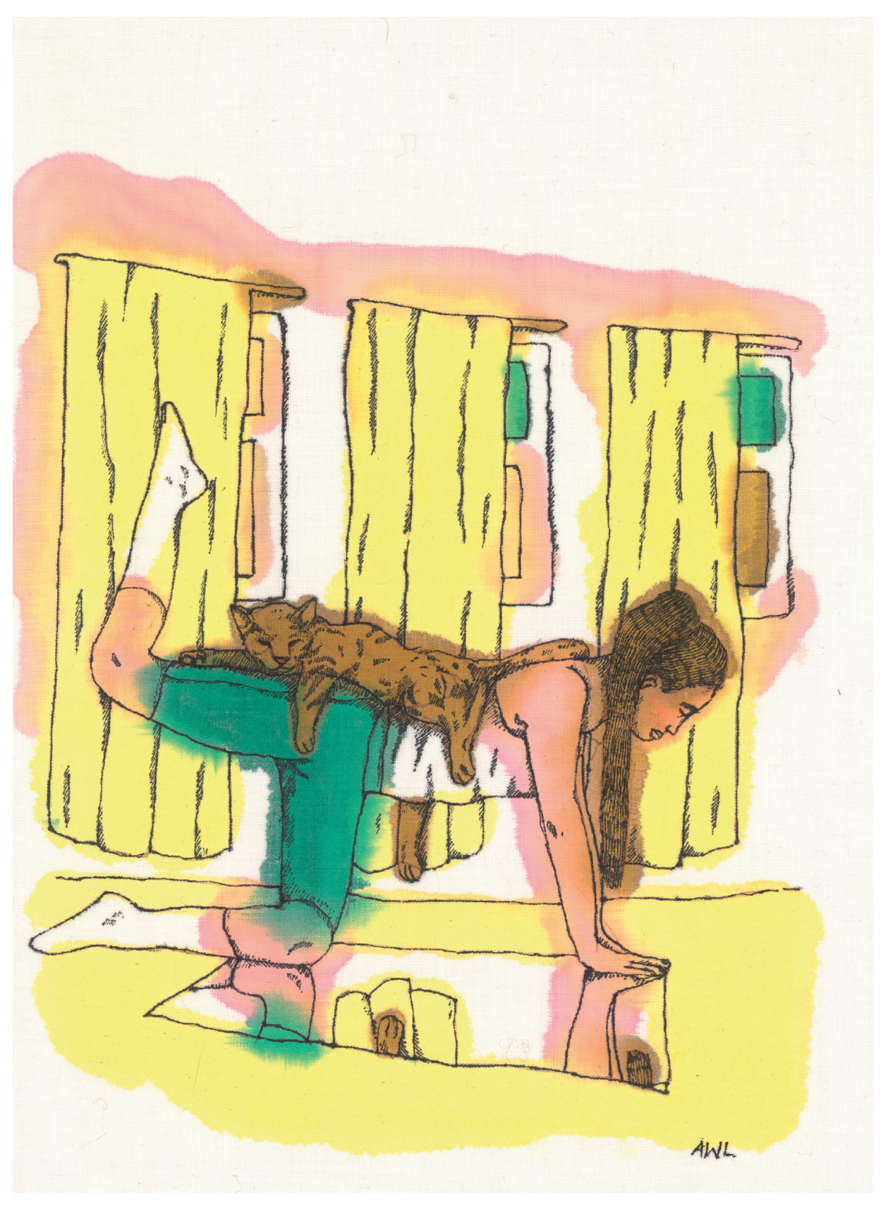
La vie intelligente - Ink for silk, pen and brush on cotton - 26 x 21 cm