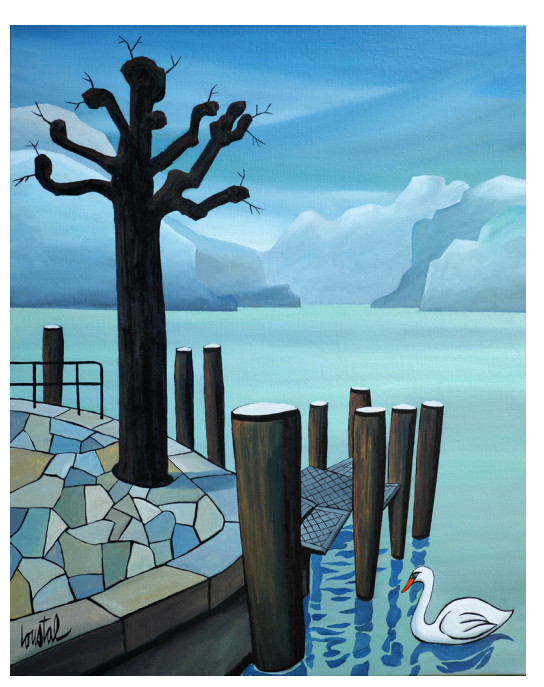
LOUSTAL - Sans titre - 2024 - Oil on canva- 92 x 73 cm Signed bottom left