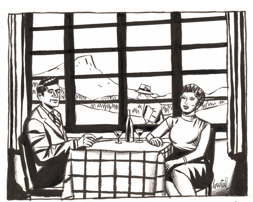
FRANÇOIS ET GERMAINE ÉTAIENT ALLÉS PASSER LEURS VACANCES EN SUISSE.

\mbox{{\bf LOUSTAL} - Cin\'e roman - Page 98 - 2025 - India ink and black pencil on paper - 20,5 x 20 cm } \\ \mbox{Signed bottom right}