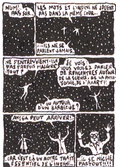
(Detail) L'Infiniment Moyen - Board 7 - 2025 Indian ink on paper - 2,7 x 1,8 cm