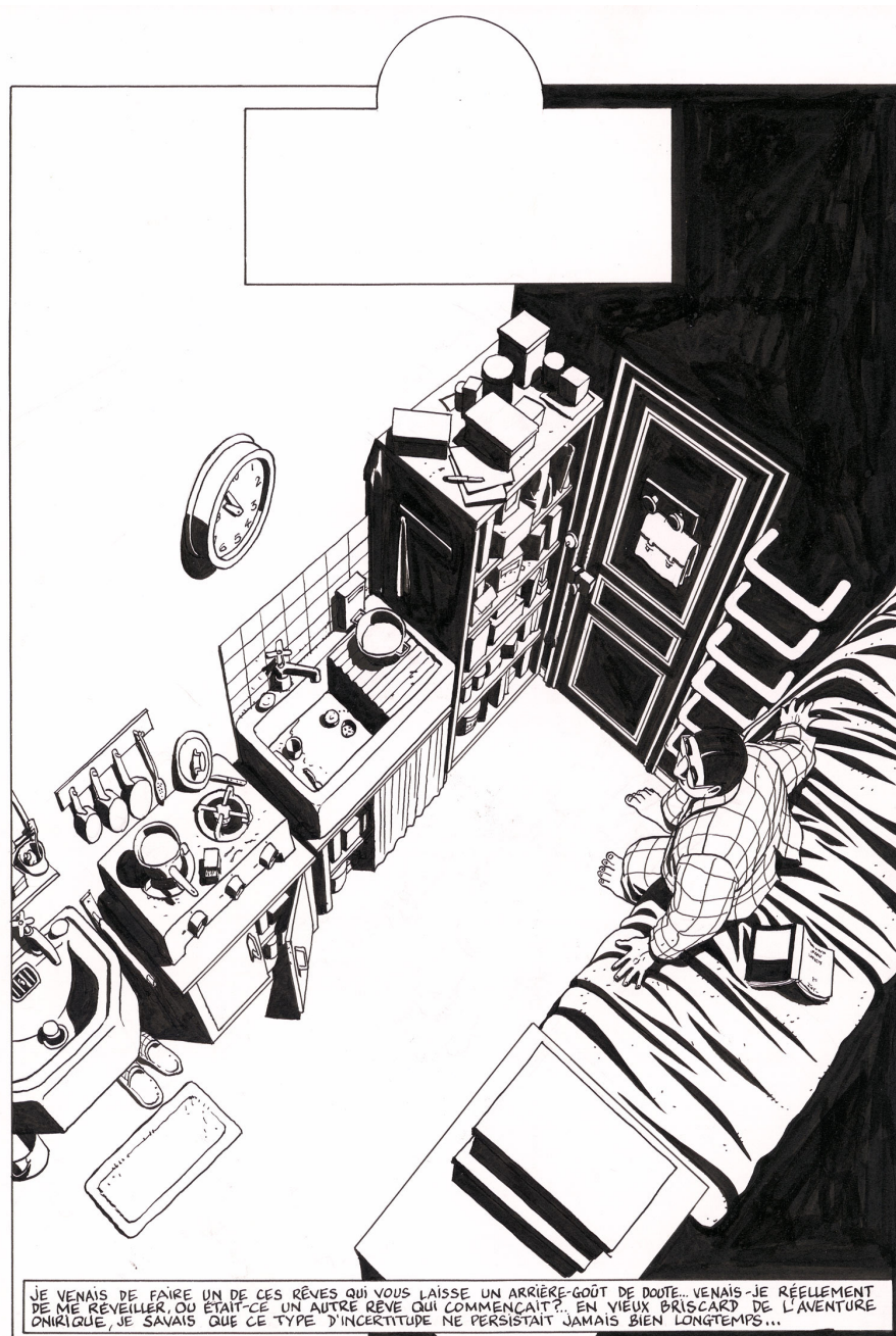
La 2,333 e dimension - Volume 5 - Julius Corentin Acquefacques, prisonnier des rêves Board 7 - 2004 - Indian ink on paper - 34 x 23 cm

From his most popular series, Julius Corentin Acquefacques (begun in 1991), to his newest offering from Éditions Delcourt, L'Infiniment Moyen et plus si infinités dans les limites finies d'une édition minimaliste , Marc-Antoine Mathieu has been having fun with readers, of both genders. He has also been busy philosophising (but without advertising the fact) possibly following in Gébé's footsteps.