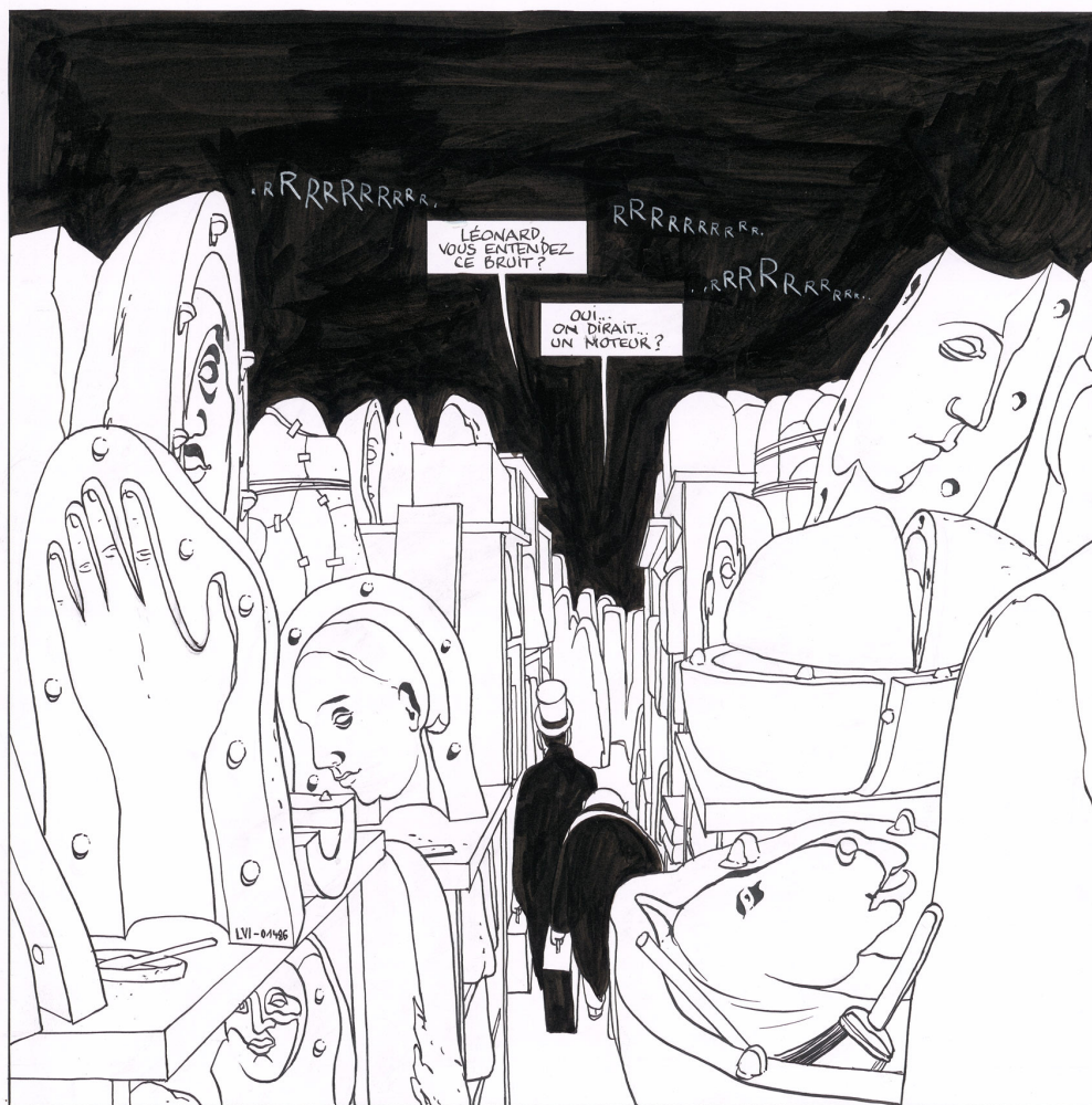
Les sous-sols du Révolu - Board 17 - 2006 - Indian ink on paper - 27 x 27 cm

With each new album, Mathieu suggests that we stop and think, offering the reader a moment of quiet reflection that is a precious antidote to the mindless busyness of our times. Despite this contemplative quality, his albums are adventure-packed and the twists and turns of his plots constantly surprise us. In terms of both form and content, a book by Marc-Antoine Mathieu leaves the reader in some sense changed by his or her experience. On offer to viewers thanks to this retrospective exhibition is a multifarious array of original artworks in the form of plates and unique illustrations.