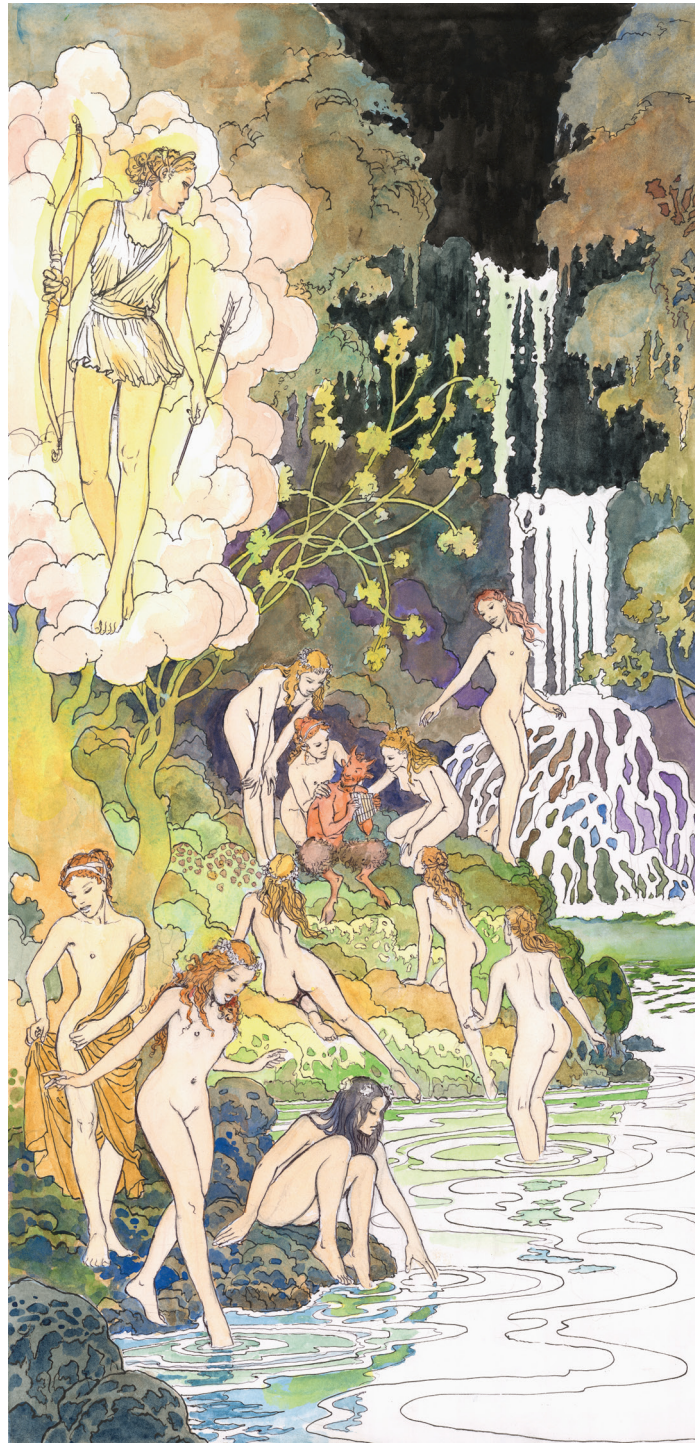
Sinistra - Dessin - 57,5 x 27,8 cm

From eroticism to science fiction and historical narrative, working solo or in collaboration with Hugo Pratt, Federico Fellini, Alejandro Jodorowsky or Umberto Eco, over the years Milo Manara (born in Luson, Italy, in 1945) has created an oeuvre that is world renowned and which draws on the artist's abiding passion for beautiful tools and beautiful paper, and for different techniques capable of breathing life into an image (sequential or otherwise). Manara's images have nothing to do with fashion: elegant and a touch enigmatic, they possess an utterly timeless quality.