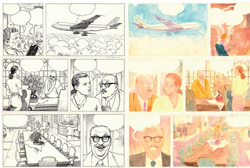
Milo MANARA - Le Décllic - Une femme sous influence - Tome 1 - Plate 3 - 1984 - Indian ink on paper - 61 x 45,7 cm

From 30 April to 31 May 2025, the Huberty & Breyne gallery is hosting a retrospective of original plates by Milo Manara. A homage to one of the great exponents of European comic strip, this exhibition displays the exceptional richness of Manara's œuvre with its combination of sensuality, poetry and exquisite craftsmanship. Plates taken from Le Singe , Les Aventures de Giuseppe Bergman , Le Décllic , Le Parfum de l'invisible , L'Été indien and Les Borgia offer visitors an opportunity to study the evolution of an artist who has created a style across the decades that is unmistakably his own.