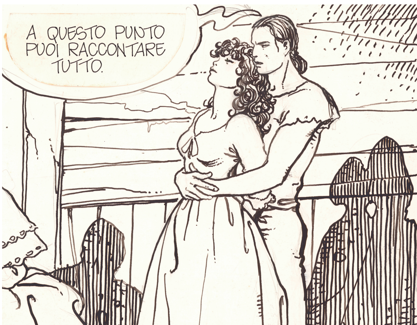
Milo MANARA - Un été indien (Detail) - Plate 90 - 1987 - Indian ink on paper - 60,7 x 45,8 cm