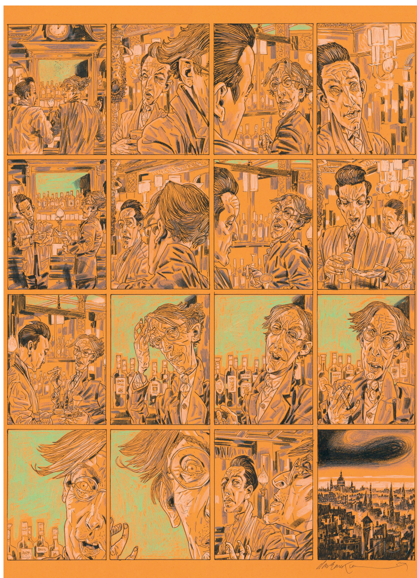
Black Dog, les rêves de Paul Nash - 2017 - India ink and pastel on paper - 63 x 48 cm Signed bottom right

This exhibition invites us to experience not only the visual beauty and complexity of McKean's art but also the inner workings of his mind, as Thalamus reveals the artist's meticulous process, his reflections, his dreams, and his obsessions. For those who have followed McKean's journey over the years, and those encountering his work for the first time, this retrospective promises an encounter with a visionary whose influence continues to shape the landscape of contemporary art and storytelling.