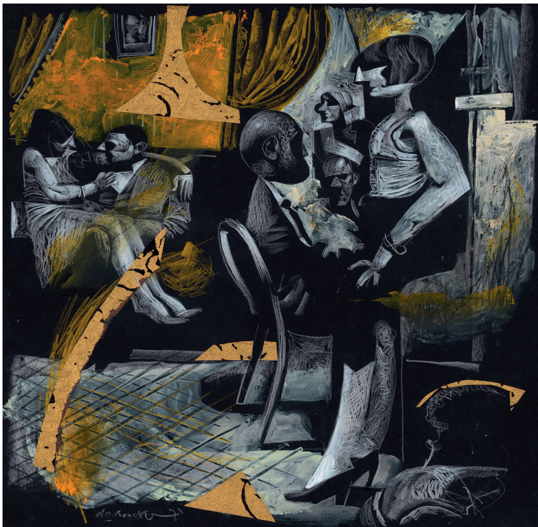
Man, Woman and Sin (1927) - 2022 - Acrylic, coloured pencil, paper collage on black board - 29,3 x 30 cm Signed bottom left

This September, Huberty & Breyne proudly edits the French version of Dave McKean's highly anticipated book Thalamus , part one. It is a testament to a singular artist's ability to see beyond the ordinary, to capture the essence of our inner worlds, and to translate those visions into something both strange and familiar, often unsettling, yet always sublime. Through his words, McKean reflects on his creative evolution, offering insights into the alchemy of imagination that has fuelled his unparalleled body of work.