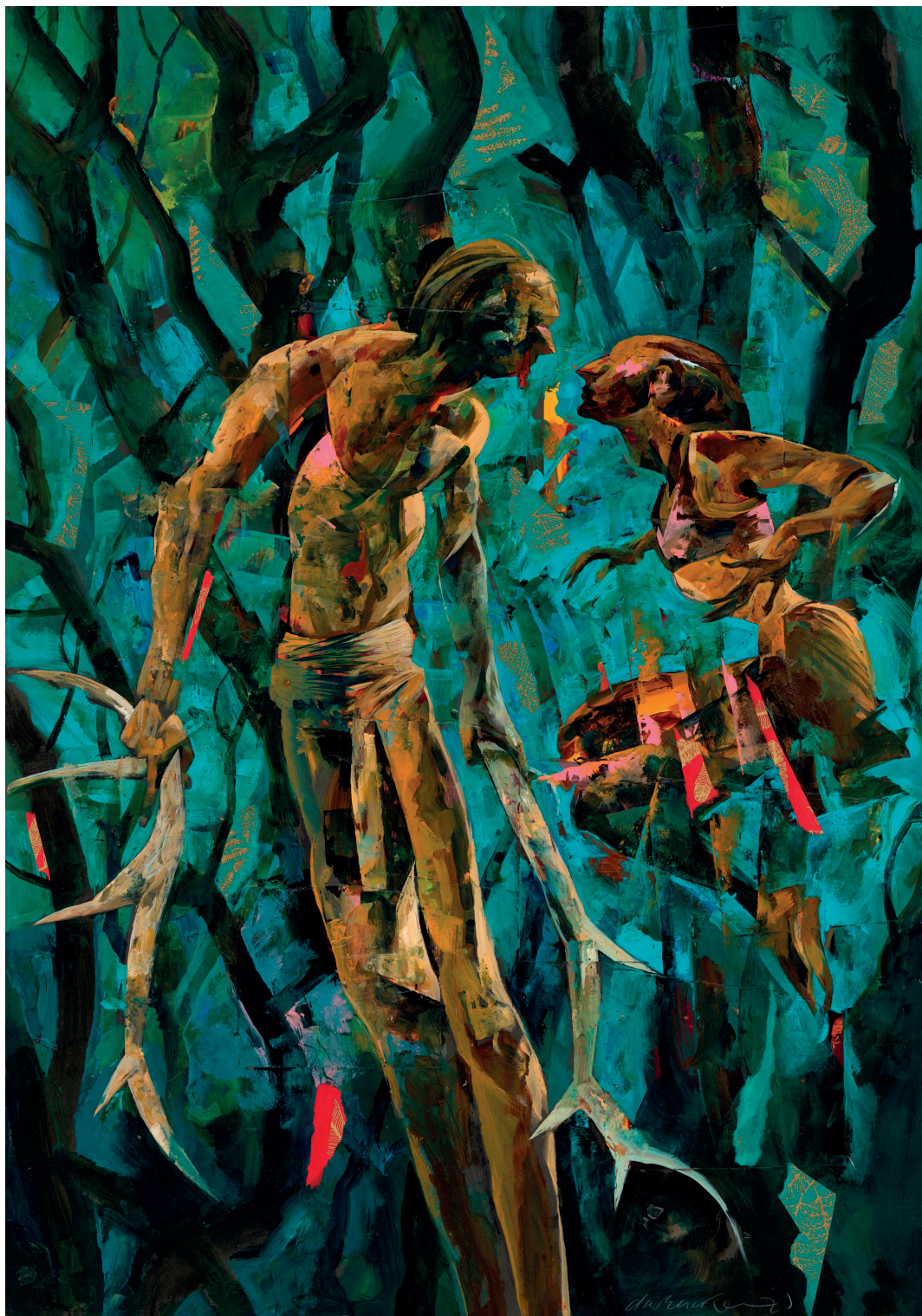
Apophenia - 2018 - Technique mixte sur carton - 84 x 59,3 cm - Signed bottom right