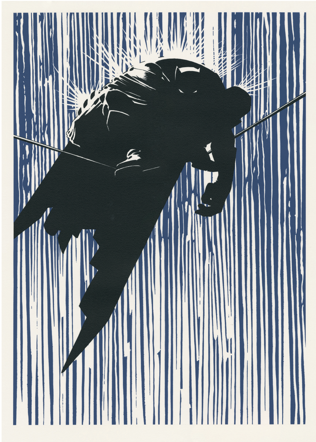
Frank MILLER - Batman - Dark Knight - 2024 - 3-color silkscreen print on paper - Edition of 150 copies - 70 x 50 cm Signed and numbered by the artist - Produced on the presses of the Tchikebe workshop in Marseille