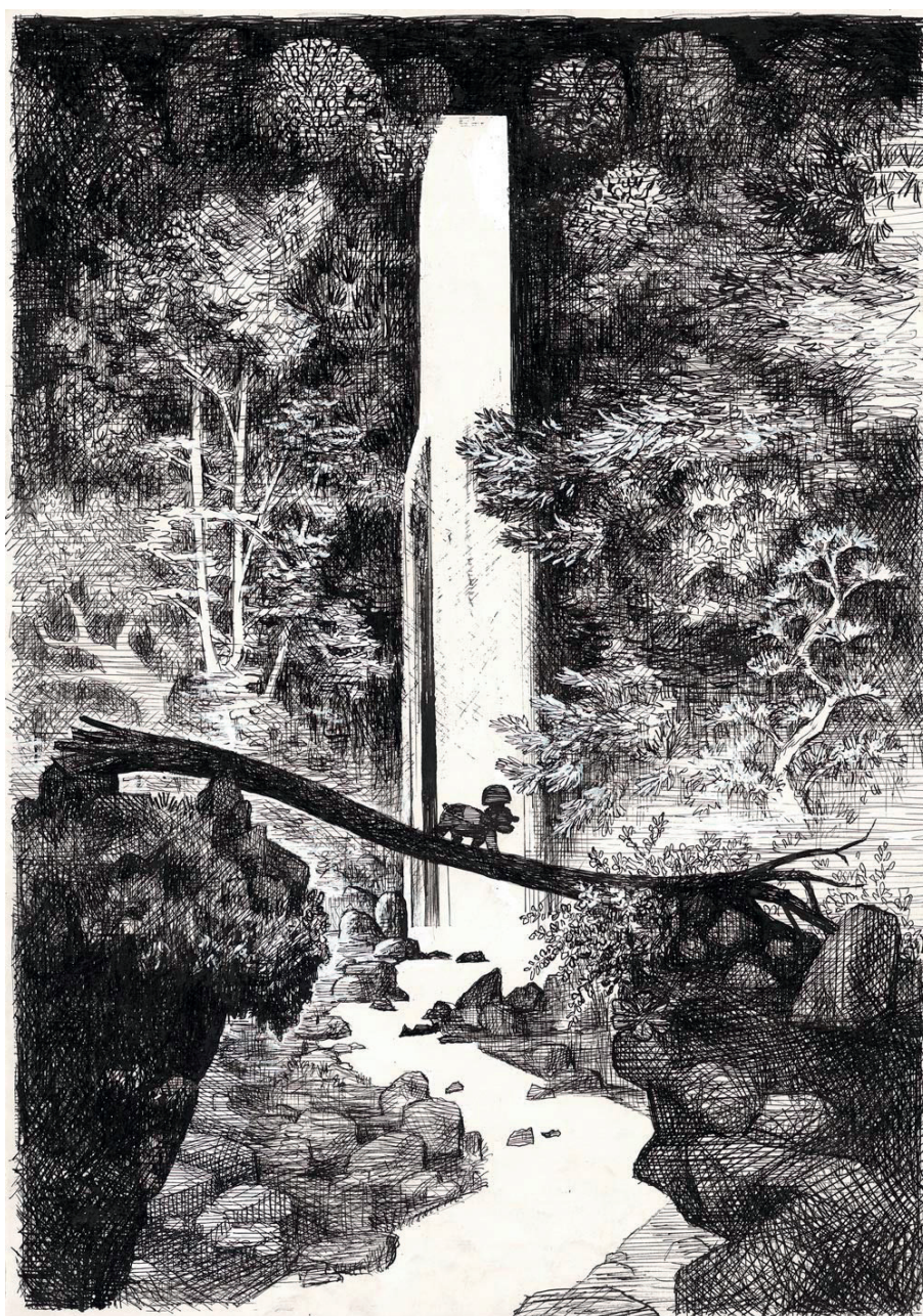
GariGari - 2025 - Indian ink on paper - 42,1 x 29,7 cm

The Huberty & Breyne's espace Chapon gallery is delighted to be hosting an exhibition devoted to Hugues Micol's two most recent works, GariGari (Éditions Cornélius, April 2025) and Mimésia (Éditions Futuropolis - Musée du Louvre, September 2025). In this selection of some 60-plus original artworks, viewers can admire both Micol's formal spontaneity and his brilliant drawing technique by comparing the black and white approach of GariGari – which employs all the delicacy of a Goya engraving – with the mixture of watercolour and luminous gouache in Mimésia . This is an exhibition absolutely not to be missed.