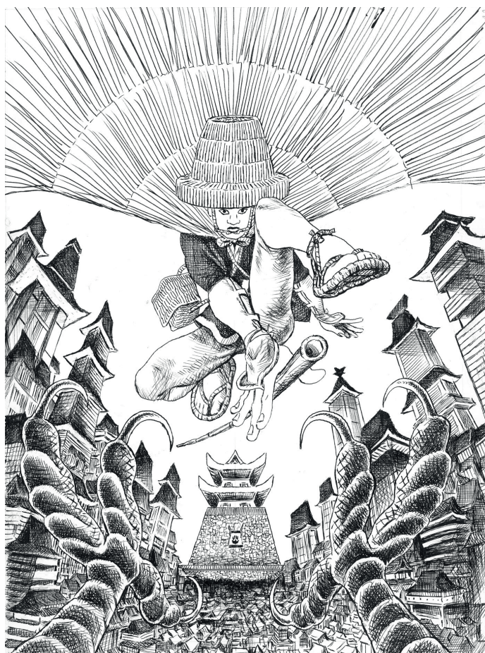
GariGari - Album's cover - 2025 - Indian ink on paper 42,1 x 29,7 cm