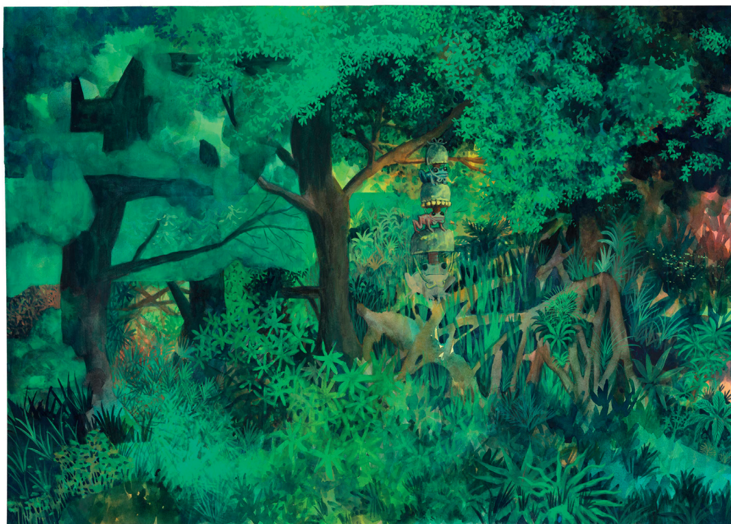
GariGari - 2025 - Gouache and watercolor on paper - 50,5 x 70,5 cm - Signed bottom right

“In the age of modern technology, a drawing is an insignificant thing... And yet a mere pencil stroke can conjure up an entire horizon. That's mind-blowing when you think about it.” These words, which Hugues Micol attributes to his protagonist in Saint-Rose: À la recherche du dessin ultime (published by Futuropolis in 2019), sum up the evocative power of drawing and the infinite possibilities of comic strip tirelessly explored by the artist since the appearance of his first publication, Chiquito La Muerte , in 2000. A prolific author and one hard to pigeonhole, Hugues Micol negotiates different genres with ease, constantly pushing back the boundaries of his art. In one publication after another, he explores the possibilities of the drawn line, offering his readers graphic universes that are always different each from the last – from the fantastic baroque trilogy Romanji to Black Out , a reinterpretation of the history of American cinema, via Micol's idiosyncratic vision of the Far West in Whisky , the science-fiction world of Agughia and the Terre de Feu fantasy adventure... Working either independently or in tandem with writers such as Lou Hui Phang or David B., this comic strip genius uses the medium as a fertile soil in which to develop his visual experiments.