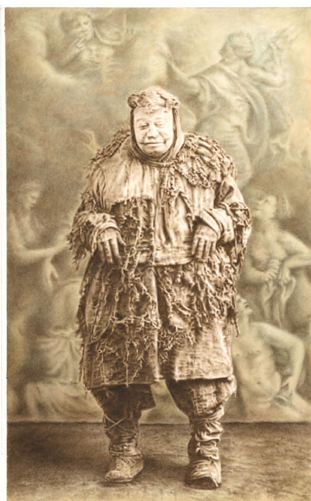
Milan Jaspers - The Pig - 2024 - Watercolor on paper 42,3 x 26,3 cm - Signed bottom right

Alcohol may have been one of the "salutary and medicinal" corrosives that Blake regarded as a requisite means of cleansing the doors of perception, thus enabling human beings to see things as they really are – in other words, infinite. Without necessarily being directly or closely linked to alcohol, Jaspers' drawings provide an opportunity to explore this extraordinary substance and the perspectives it has opened up through human creativity.