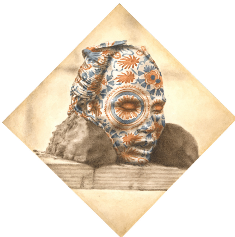
Milan Jaspers - Gôkumon - 2024 - Watercolor on paper - 14,6 x 14,6 cm - Signed back

Milan Jaspers develops his images in a subtle balancing act of revelation and restitution that derives from the shared vision of drawer and painter. Employing a watercolour palette true to the traditional sepia tints of early photographs, he also incorporates colourful motifs emblematic of our modern world. The manual manipulation of the artist's brush, which depends on patience and precision, acts here as a counterbalance to the revolutionary instantaneity of the photographic process, painting reflecting the contemporary importance of "taking one's time".