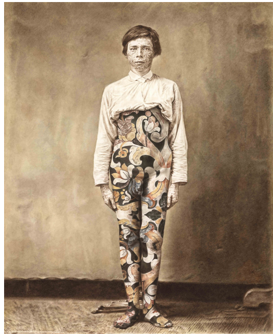
Milan Jespers - Vergogna II - 2024 - Watercolor on paper 52 x 41,5 cm - Signed bottom right

The first series – entitled "Vergogna" (derived from a Latin word meaning sense of modesty or shame) – is made up of four full-length portraits of seminaked men in a simple interior.