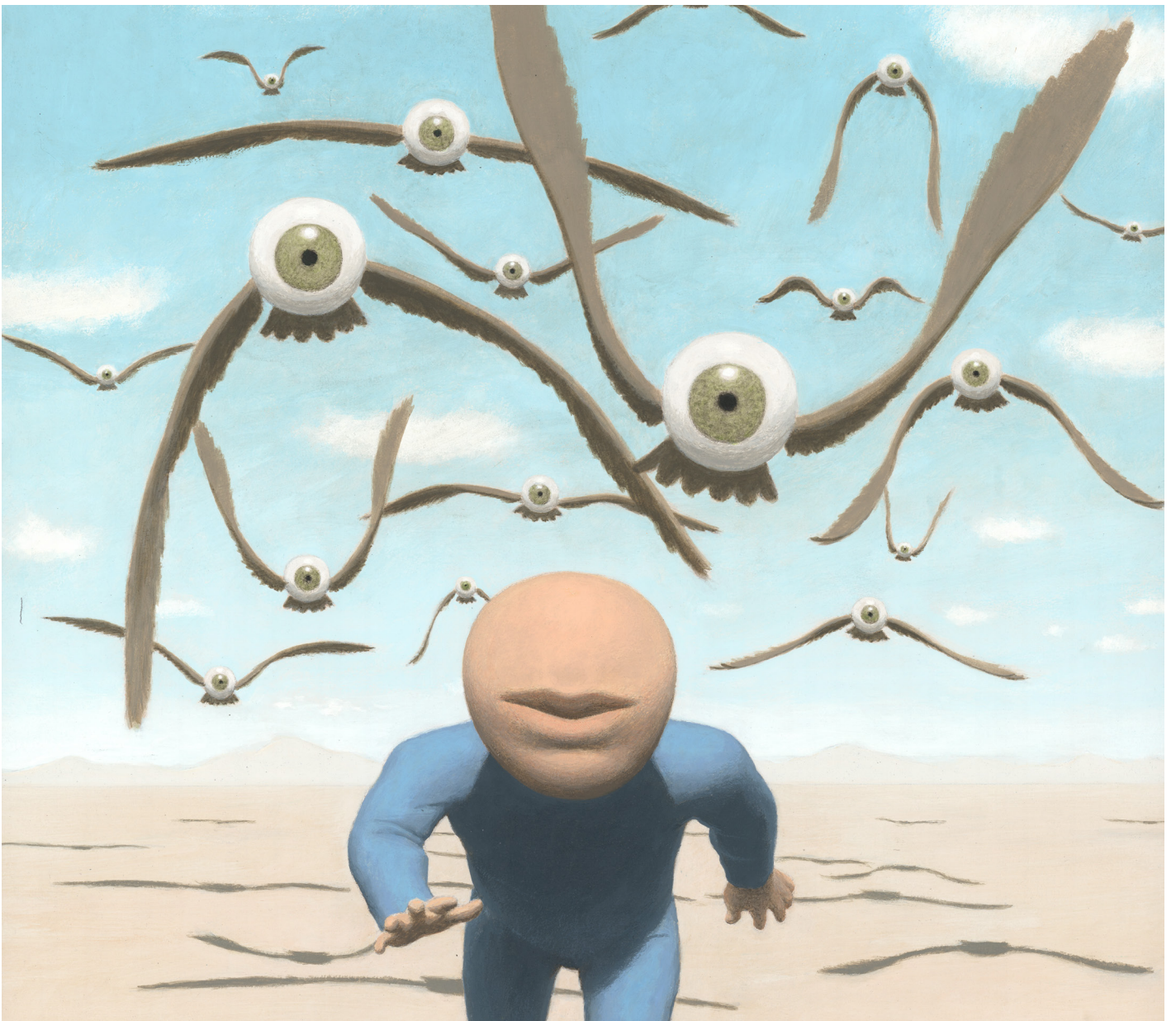
(Detail) Le fugitif - 2026 - Acrylic on paper - 55 x 43 cm - Signed and dated on the back