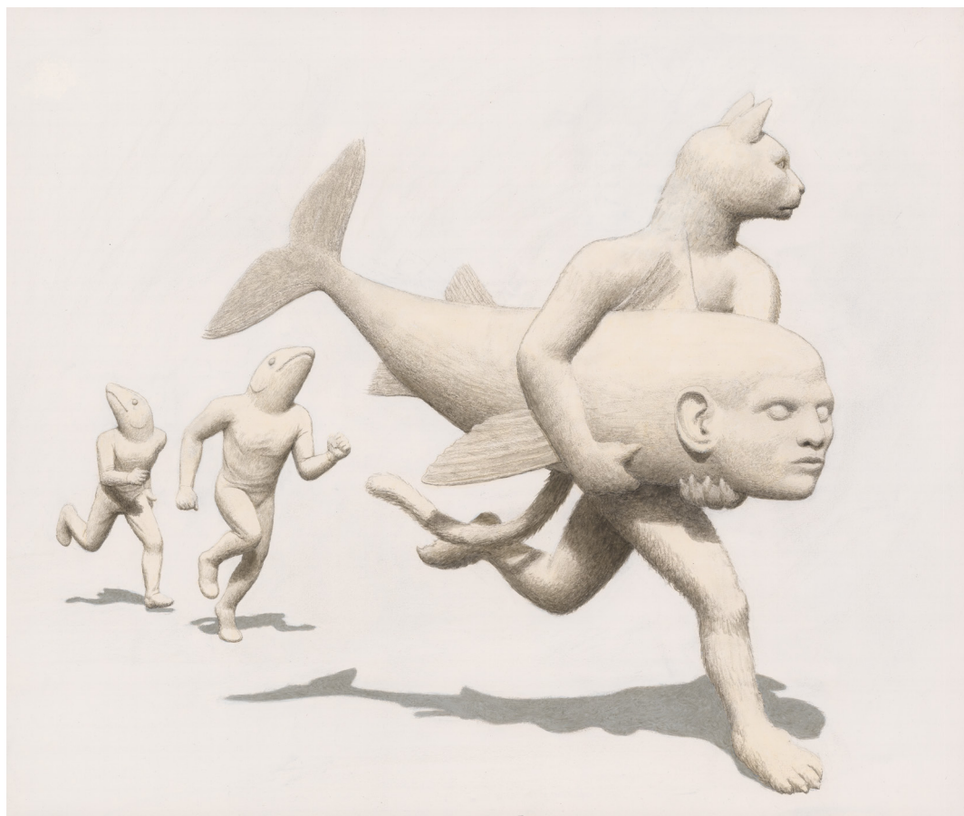
Pêche-poursuite - 2026 - Acrylic on paper - 44,5 x 53,5 cm - Signed on the back

In this densely populated, silent universe, the viewer is invited to SEE and free to interpret at will.