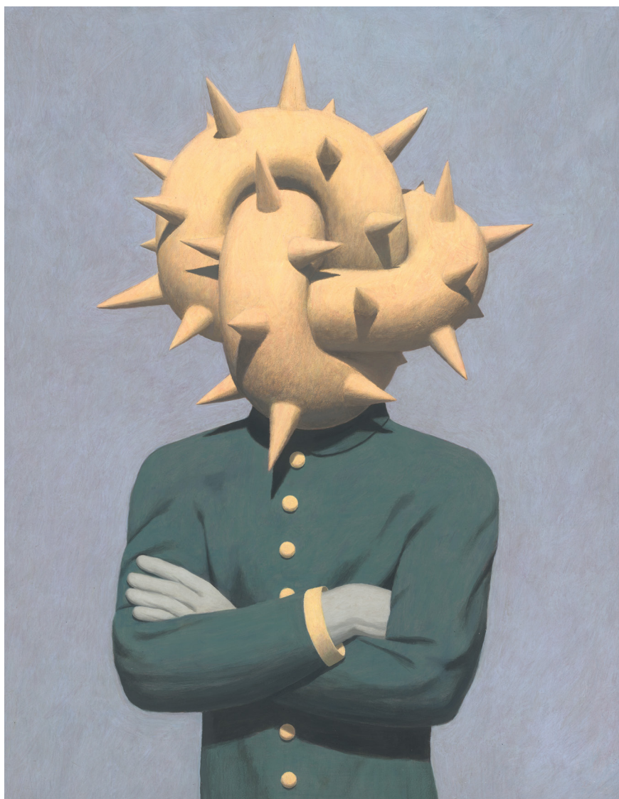
Colonel Noupique - Acrylic on paper - 60 x 46,7 cm - Signed and dated on the back

Far from being narrative or illustrative, Monestier's work primarily engages the viewer in an experience of seeing. He or she is constantly referred back to the materiality of the image: harsh light, crisp shadows, destabilised perspectives and acid colours — which can be almost unreal — compose scenes whose mystery lies less in what they represent than in their manner of existing pictorially.