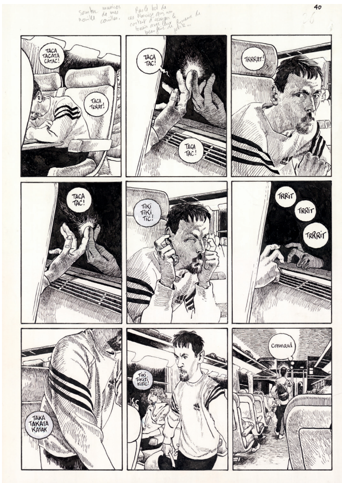
Le Dernier Sergent T01 - Planche 40 Encre chine sur papier - 37,1 x 26,5 cm