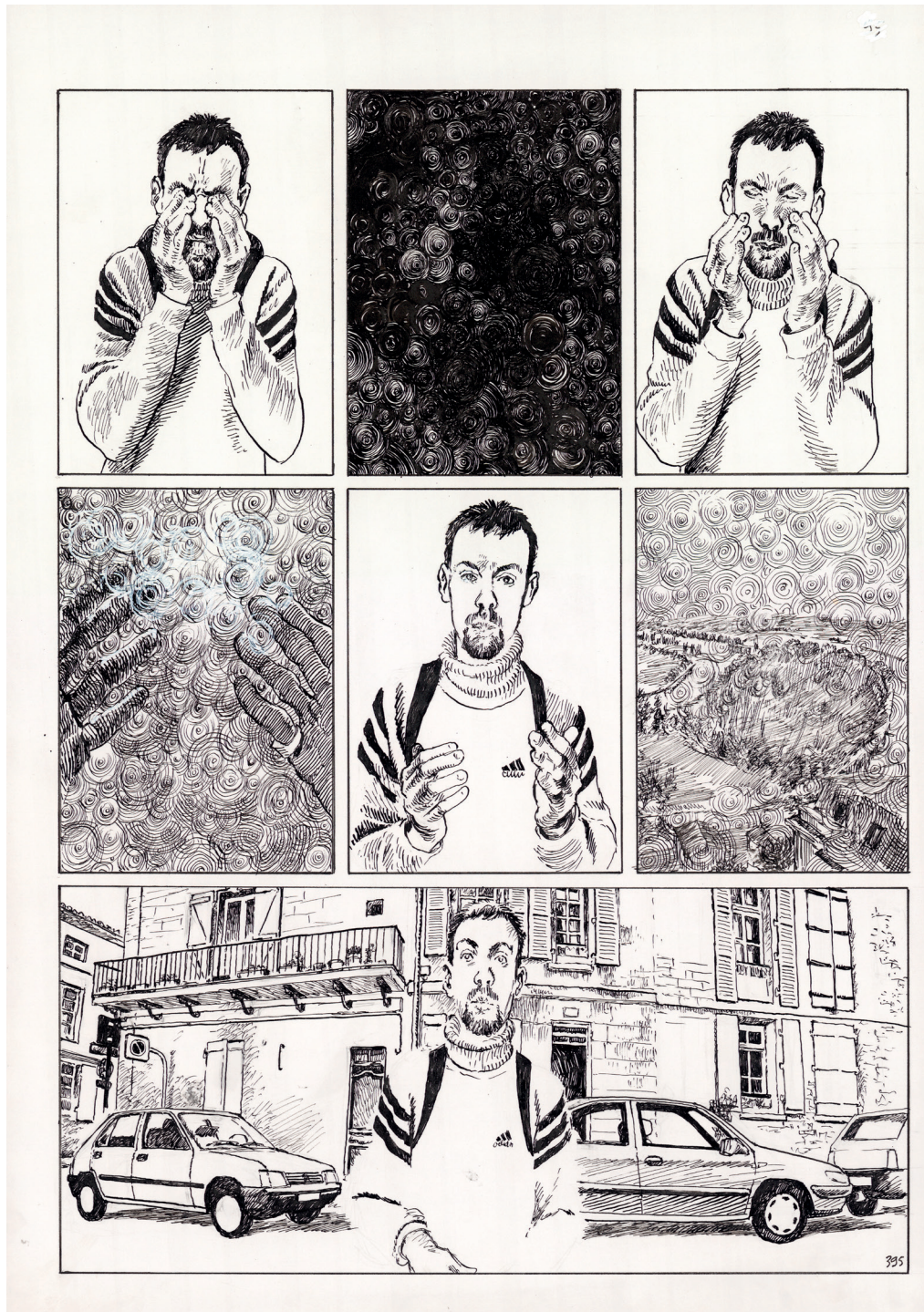
Le Dernier Sergent T01 - Planche 395 - Encre chine sur papier - 37,1 x 26,5 cm

– emotions are palpable in every one of his illustrations. The selection of pages on display here is accompanied by a series of drawings – portraits and landscapes – that offer a new perspective on this artist's work.