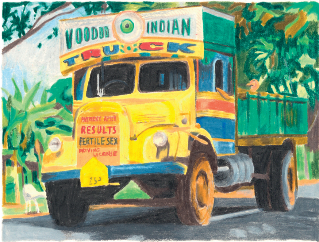
Stéphane DE GROEF - Voodoo Indian Truck -2015 - 9 x 12 cm - Colored pencils on paper