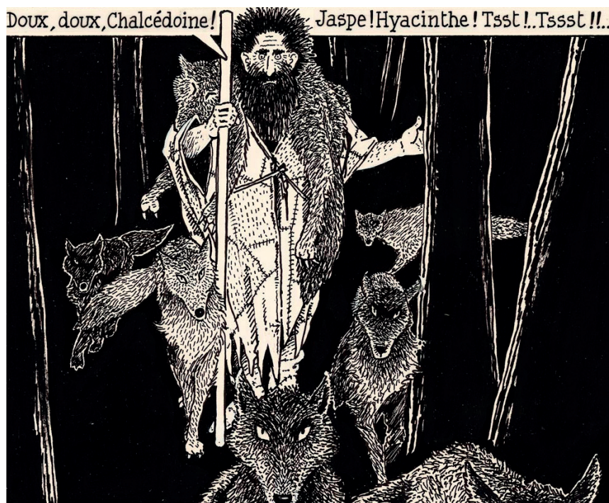
Angelot du Lac, Le temps des loups, Tome 1 - 45 x 34 cm

This exhibition will be showing a selection of plates from his series Angelot du Lac , which tells the story of a group of orphans in the Middle Ages struggling to survive in a country ravaged by the Hundred Years War. There will also be plates from Marion Duval , his series relating to a 9-year-old girl living in Paris, and various drawings taken from the albums Corbeille et Corbillo and John Chatterton (whose protagonist is a feline detective).