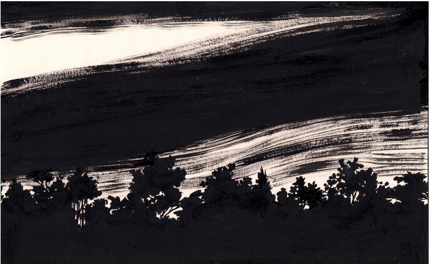
Angelot du Lac, Le temps des loups, Tome 1 - 45 x 34 cm