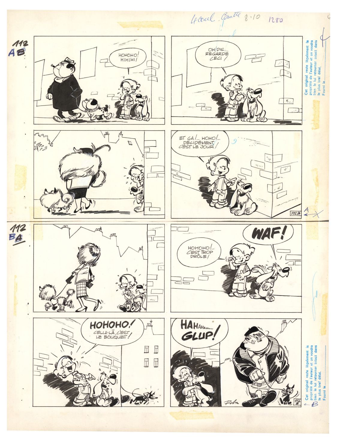
60 gags de Boule et Bill, Volume 2, 1964, Page 54, India ink on paper. 39 x 28 cm.