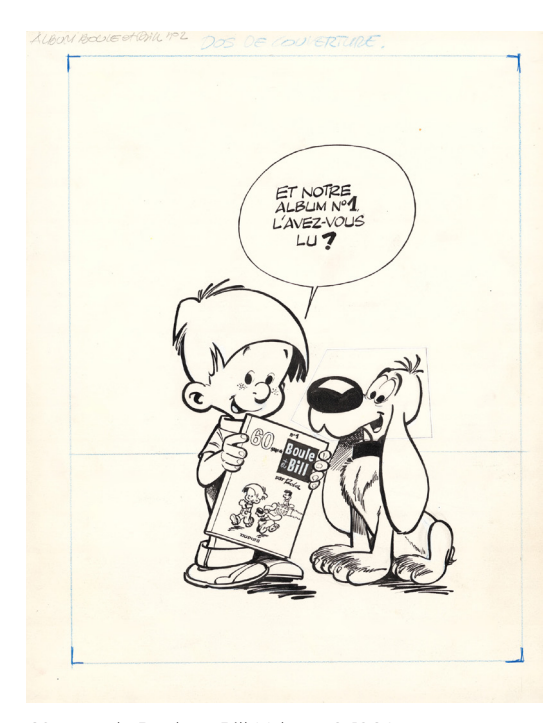
60 gags de Boule et Bill, Volume 2, 1964, Back cover, India ink on paper. 29 x 21,5 cm.

Since his death in 2006, Roba's 1,149 original plates have been safeguarded by the Fondation Roba, in line with their creator's wishes. Roba's beautifully simple and humorous œuvre – a veritable jewel of the Belgian comic tradition – is being presented to the public thanks to this free exhibition/event – a unique opportunity to rediscover those famous characters so many of us knew and loved as we were growing up.