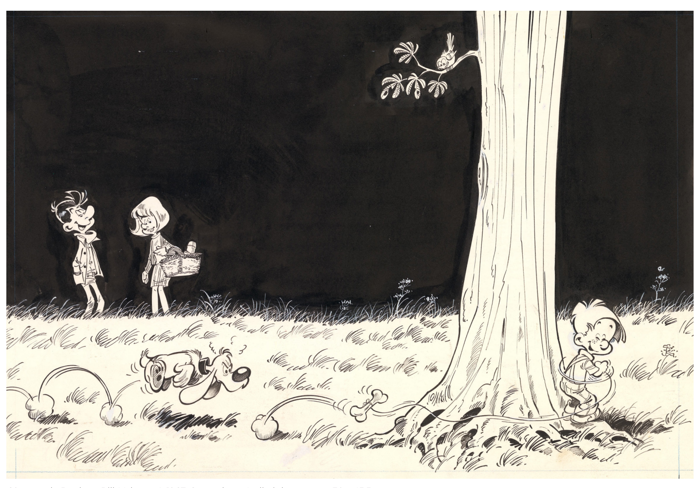
60 gags de Boule et Bill, Volume 4, 1967, Cover sheet, India ink on paper 30 x 45,5 cm.