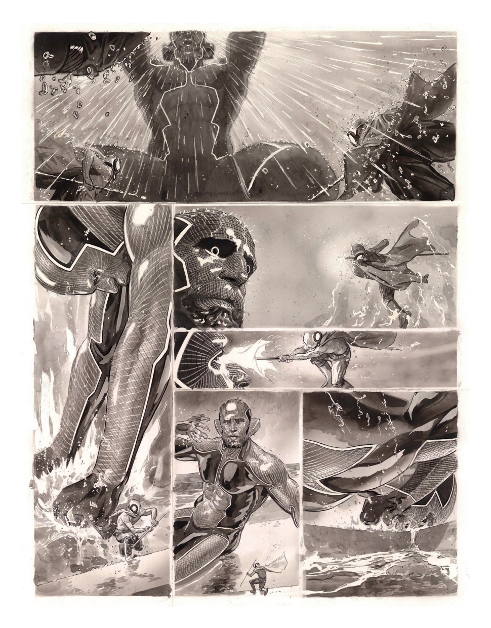
Elecboy - Le Mur Du Temps Tome 4

printed albums. Executed in Indian ink, these works are incredibly delicate. Each frame is meaningful, each image clearly intelligible. Switching between different drawing implements, different-sized brushes, Jaouen influences how we read these compositions, creating a mood that is utterly unambiguous. He puts all his talent in the service of his story, equally comfortable with action scenes and scenes of quiet contemplation, with technical drawings involving mechanics and microprocessors and dreamlike settings that rely on a wash technique. The large-format illustrations adopt a different approach in which Jaouen uses a dry technique, essentially that of single-colour pastel, to explore the texture of the universe.