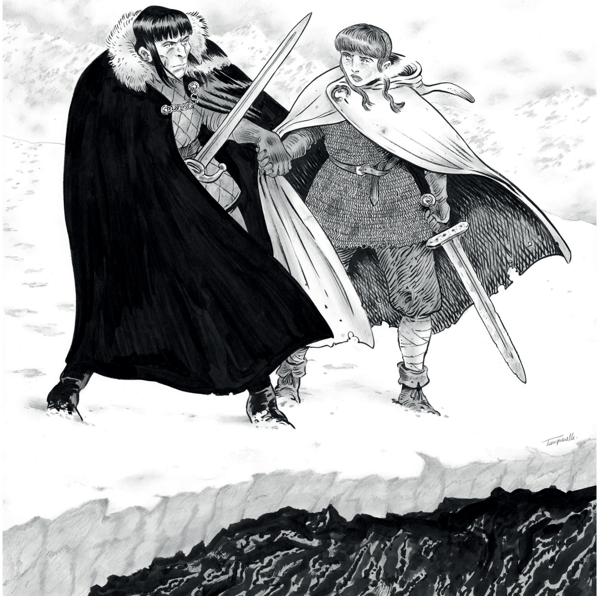
HERVÉ TANQUERELLE - La Terre verte - India ink, graphite and gouache on paper - 67,8 x 50 cm