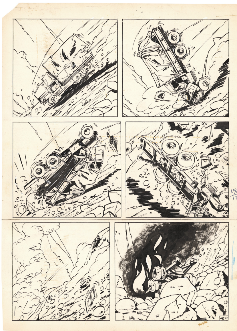
Gil Jourdan - L'enfer de Xique-Xique - Volume 5 - Board 41 - 1962 - Indian ink on paper 39 x 28 cm

Tillieux was the creator of a couple of iconic series – Félix in the 1940s, followed by the hugely successful Gil Jourdan , flagship series of Spirou magazine. The album Libellule s'évade , from the latter series, remains one of the most emblematic examples of his narrative talent. With César et Ernestine , Tillieux explored a lighter and more humorous register while continuing to write with his characteristic precision and impact.