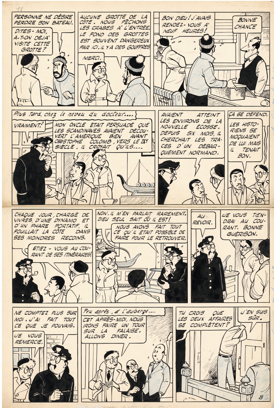
Félix - La grotte hantée - Board 5 - 1953 - Indian ink and blue pencil on paper - 44,7 x 28,8 cm