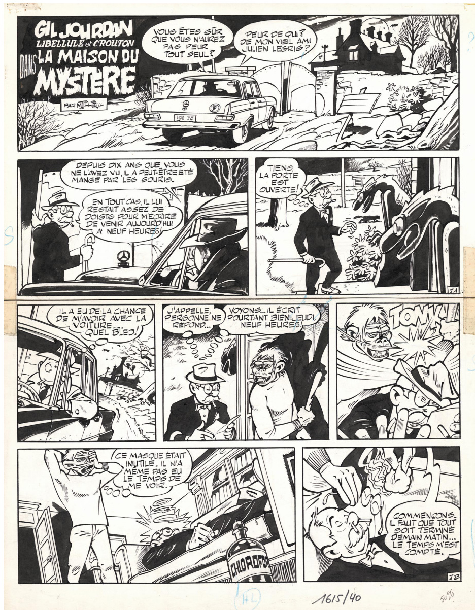
Gil Jourdan - Chaud et froid - Le grand souffle - Volume 11 - La maison du mystère - 1969 Indian ink on paper - 46,5 x 36,3 cm

From 22 May to 18 July, the Huberty & Breyne's Bruxelles | Châtelain gallery is showing a heritage – non-commercial – exhibition devoted to the work of Maurice Tillieux, which brings together some hundred original artworks belonging to the artist's family and taken from private collections. This exceptional exhibition offers a rare glimpse into the world of an author whose unique and groundbreaking oeuvre occupies a central place in the history of Franco-Belgian comics.