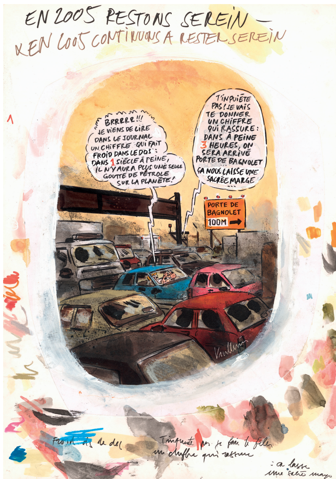
En 2005 restons sereins - Indian ink drawing with color added (28.5 x 19.5 cm) Mixed media on paper - 26.5 x 21 cm Signed lower right