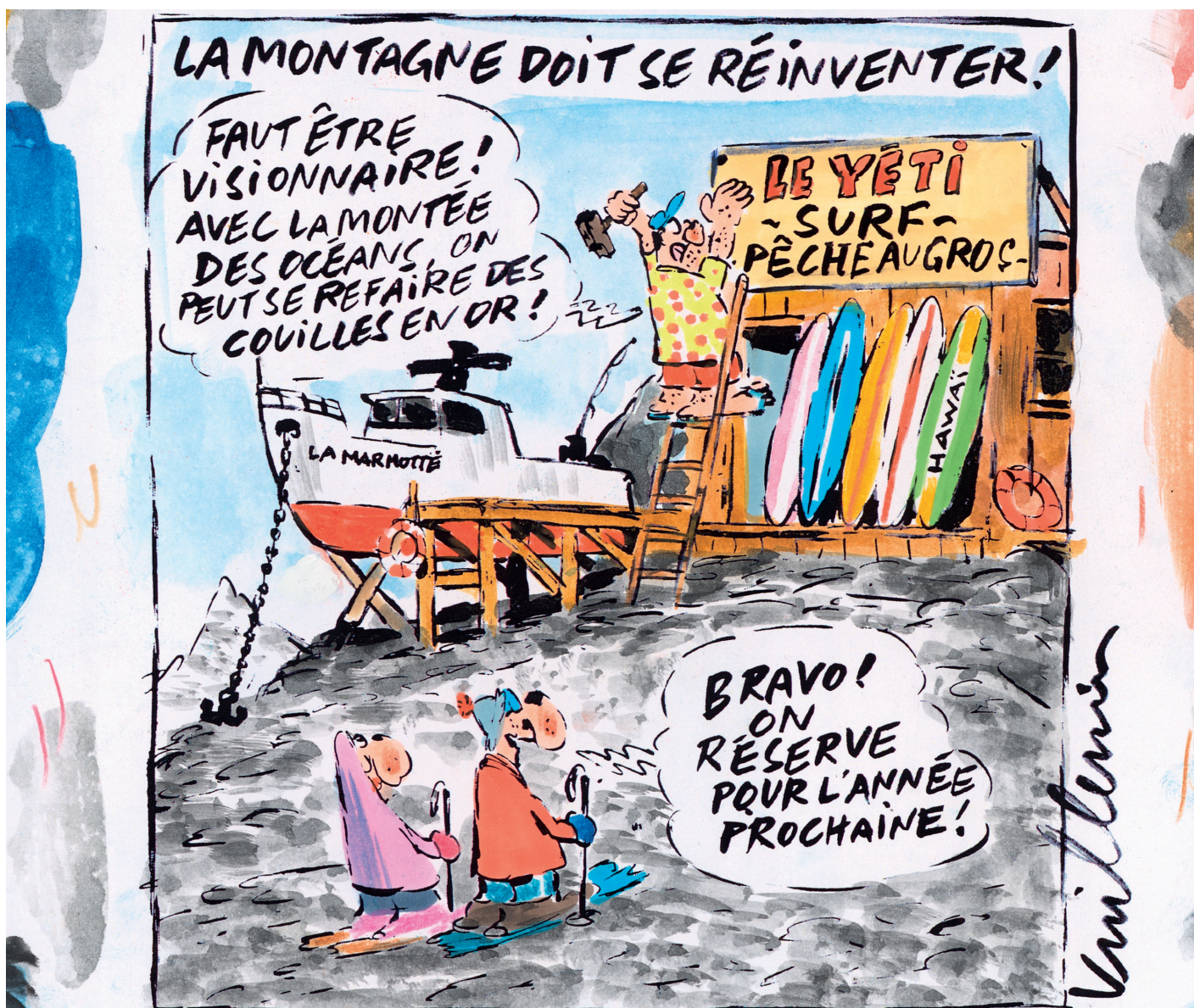
(Detail) Il faut sauver la montagne - Page in Indian ink with accompanying colorization (28 x 35.2 cm) - Mixed media on paper 29.2 x 36.5 cm - Signed lower right