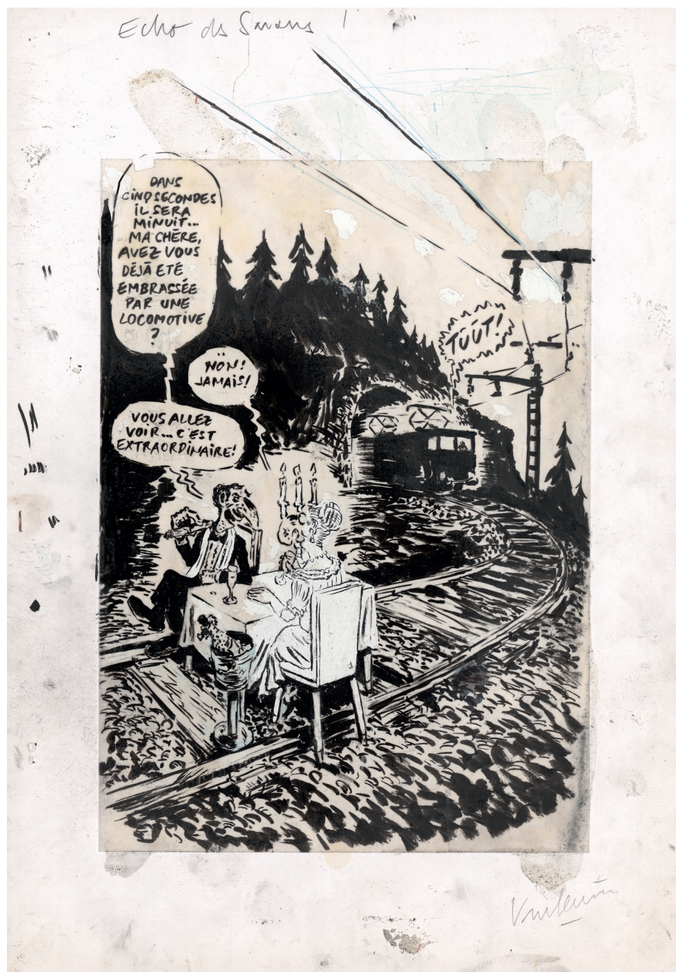
Dans cinq secondes il sera minuit - Indian ink on tracing paper, mounted on paper - 11.7 x 8.2cm Signed lower right

Philippe Vuillemin occupies a key position in the history of contemporary comics. Since the 1970s, this irreverent artist has been overturning conventions and challenging sensibilities, kicking against anything that supposedly manifests as "good taste". His energetic and distinctive style, along with his fiercely dark humour, have established Vuillemin as one of the freest and most transgressive voices of the ninth art.